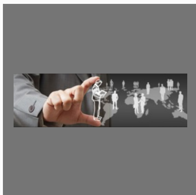
HR And Admin Outsource Services