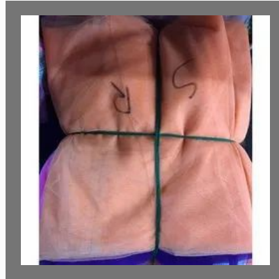
HDPE Mosquito Net Fabric