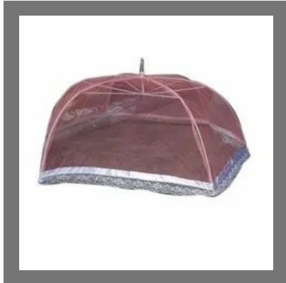
Baby Plain Pink Mosquito Net