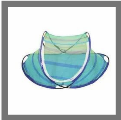
Poly Cotton Baby Mosquito Net