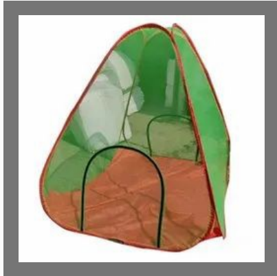
Foldable Mosquito Single Bed Net