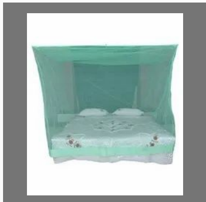
Green Hanging Mosquito Net