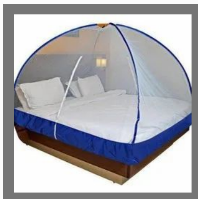
Foldable Mosquito Bed Net