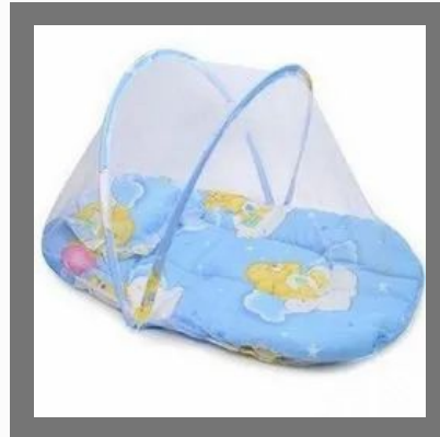
Cotton Printed Baby Mosquito Net