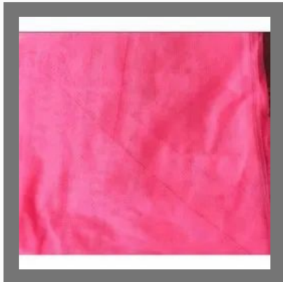
Pink Hanging Mosquito Double Bed Net