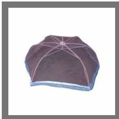
Baby Umbrella Mosquito Net