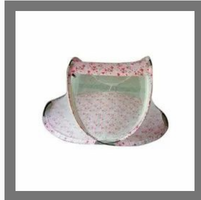
Baby Cotton Printed Mosquito Net