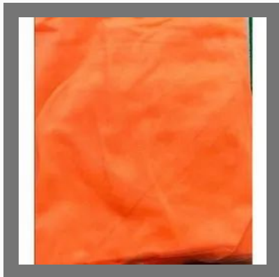
Orange Hanging Mosquito Net