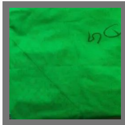
Dark Green Hanging Mosquito Net