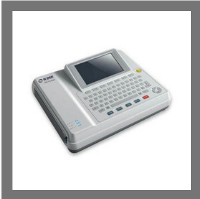
12 Channel ECG Machine With Touch Screen