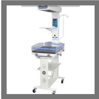
Baby Warmer Machine