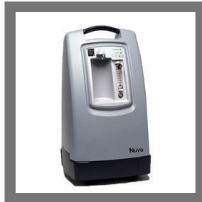
Nidek Nuvo Standard Oxygen Concentrator