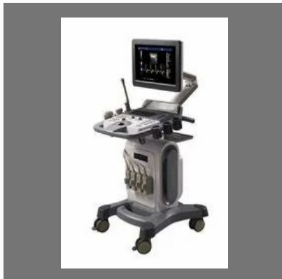
Philips HD11 Echocardiogram Machine