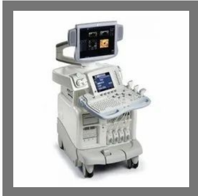
Refurbished GE Logiq p5 Ultrasound Machine