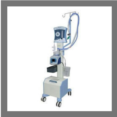
Bubble CPAP Machine