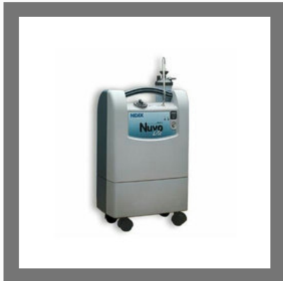
Nidek Nuvo Lite Oxygen Concentrator