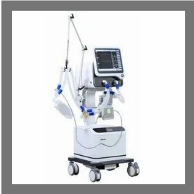
Air Liquide Ventilator