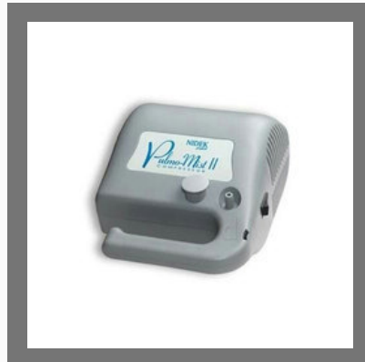
Nebulizer Medical Machine