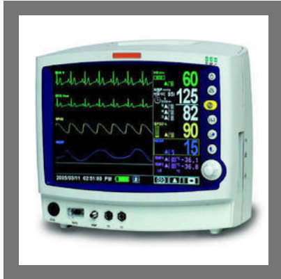
Patient Monitoring Systems