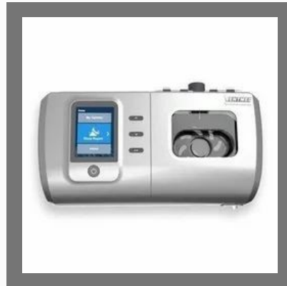
Ventmed ST30 Bipap Machine