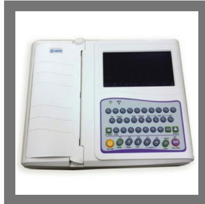
12 Channel ECG Machine