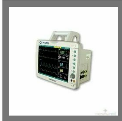
Multi Parameter Monitor