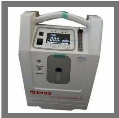
EVOX Portable Oxygen Concentrator