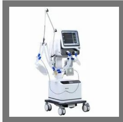
Air Liquide Ventilator