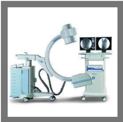
Hospital Equipment Repair Service