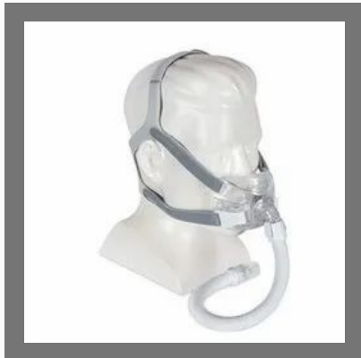
Nidek CPAP Mask