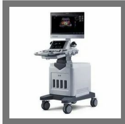
Refurbished Philips Hd7 3D/ 4D Ultrasound Machine