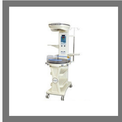
Infant Radiant Warmer