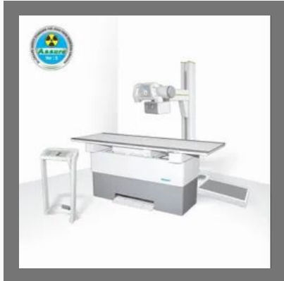
Allengers MARS 3.5 - 80 FIXED X-RAY X Ray Machine