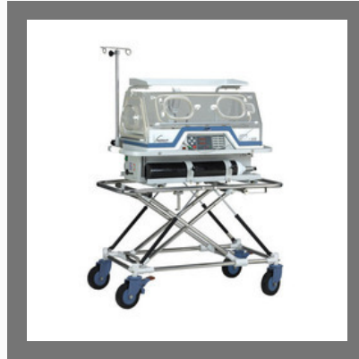
Transport Infant Incubator