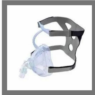
Nidek BiPAP Mask