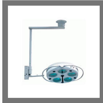
Operation Theater Light