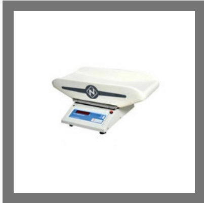
Infant Weighting Scale