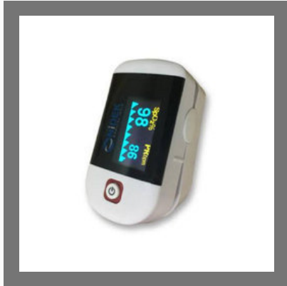
Finger Pulse Oximeter