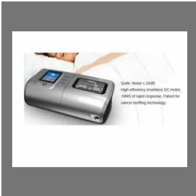
Ventmed BiPAP Machine