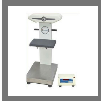
Personal Weighing Scale