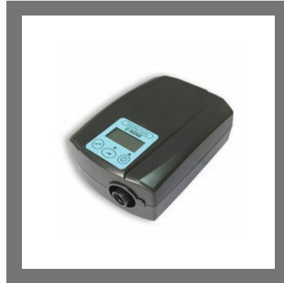
Nidek CPAP Machine