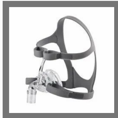
VentMed CPAP Mask