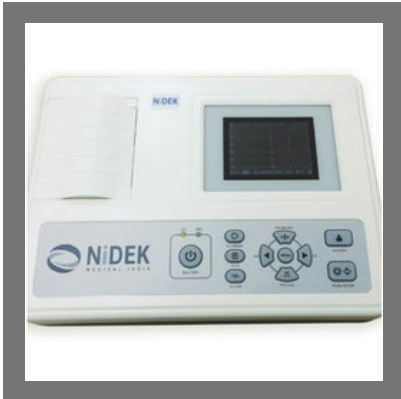
Nidek 3 Channel ECG Machine