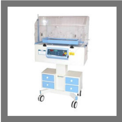
Infant NICU Incubator