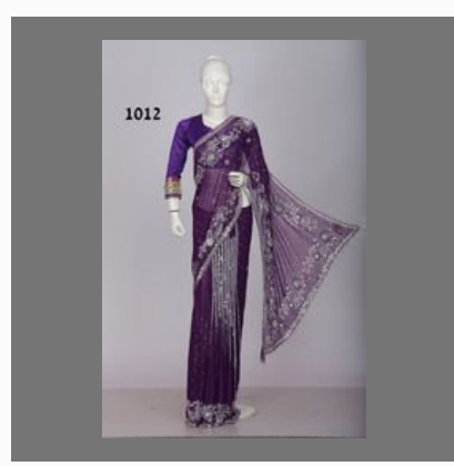
Exclusive Stone Work Sarees