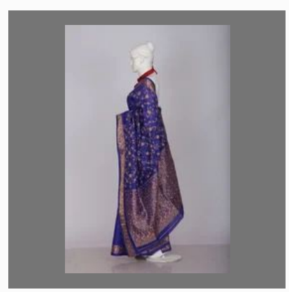
Fashionable Ladies Sarees