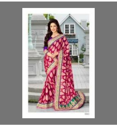
Exclusive Party Wear Saree