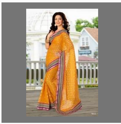
Fashionable Designer Silk Sarees