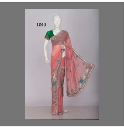
Designer Silk Sarees