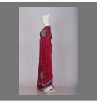
Party Wear Sarees