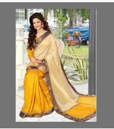
Yellow Fancy Saree