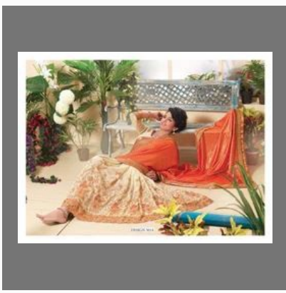
Multi Colour Designer Sarees