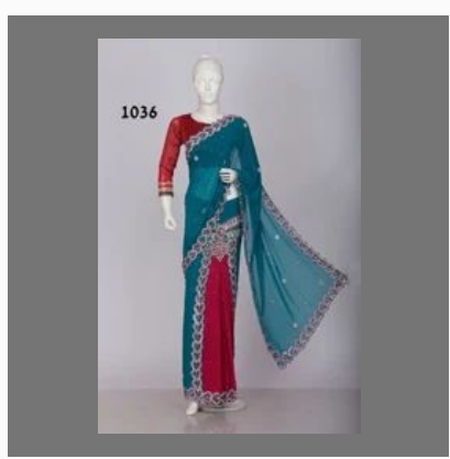
Stone Work Sarees