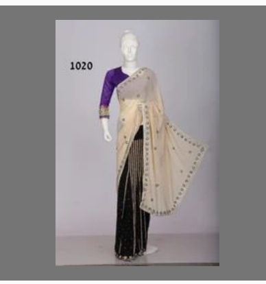
Stone Work Sarees