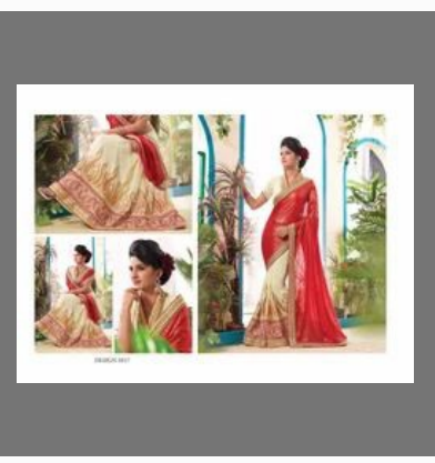
Designer Bollywood Sarees