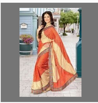
Modern Party Wear Saree