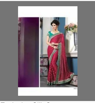
Exclusive Silk Saree