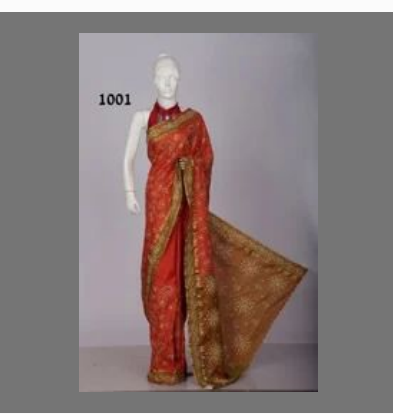
Fashionable Ladies Sarees