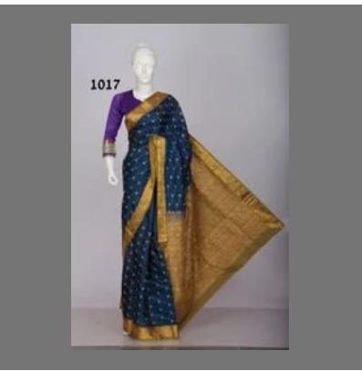
Handloom Ladies Sarees