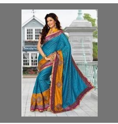
Designer Silk Saree