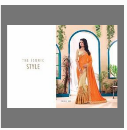
Iconic Style Sarees