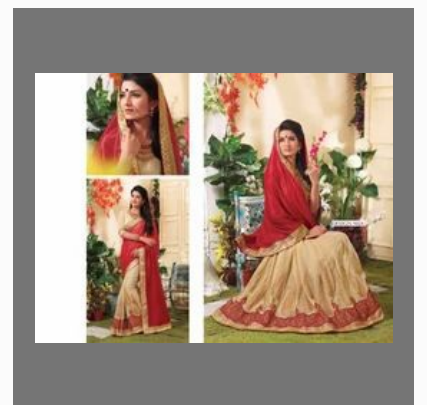
Designer Bridal Sarees