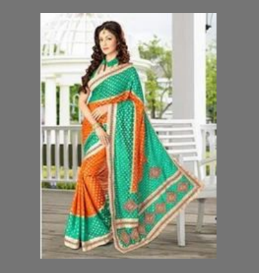
Fashionable Raw Silk Saree