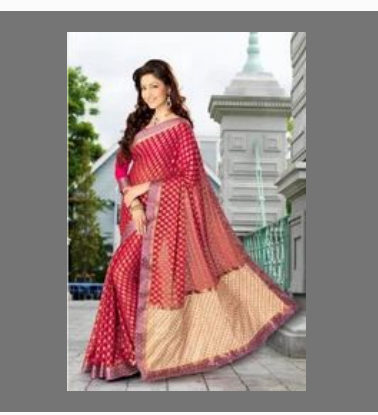
Georgette Party Wear Sarees