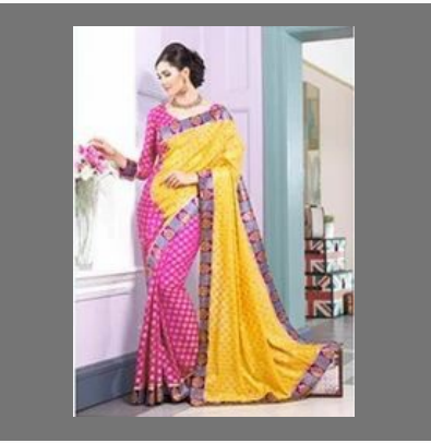
Modern Silk Saree