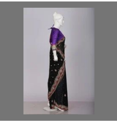
Modern Stone Work Sarees