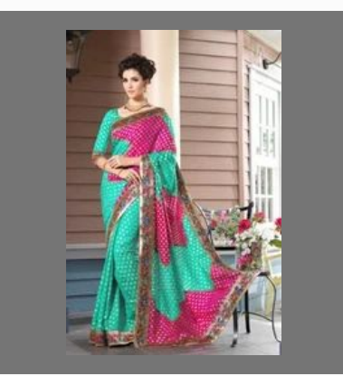
Designer Silk Saree