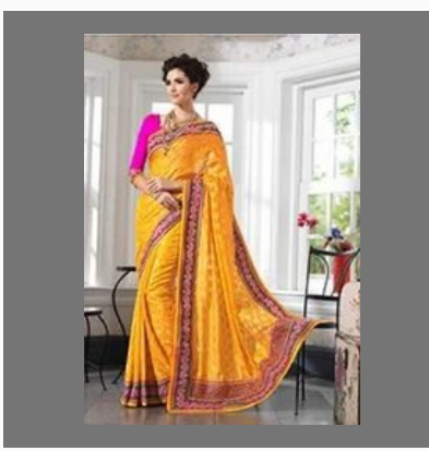
Branded Raw Silk Saree