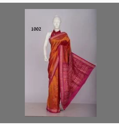
Designer Silk Saree