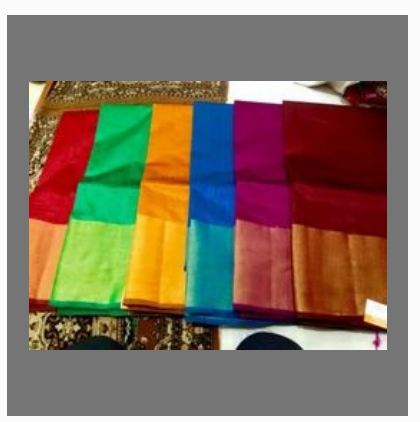
Art Raw Silk Saree