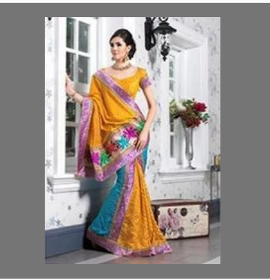
Party Wear Saree