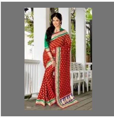
Fashionable Silk Saree