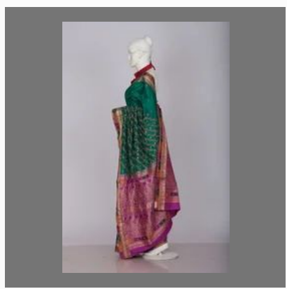
Hand Embroidery Ladies Sarees