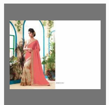
Designer Exclusive Sarees