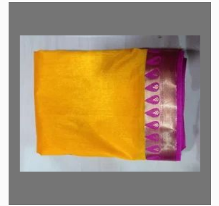
Art Raw Silk Saree