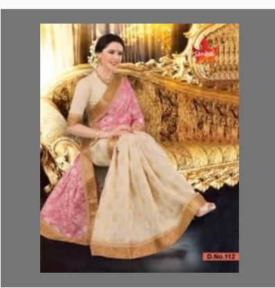
Cotton Slub Masrised Silk Sarees