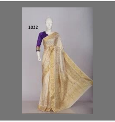
Golden Zari Ladies Sarees