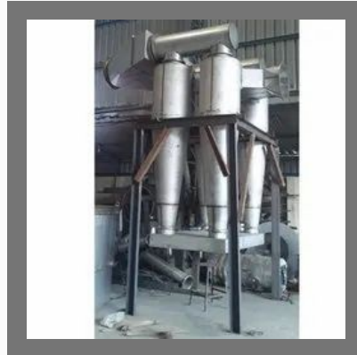
Stainless Steel Cyclone Separator