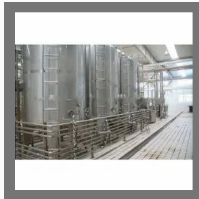
Commercial Dairy Processing Plant