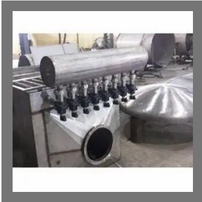
Cyclone Dust Collector