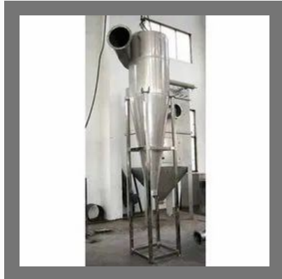
SS Cyclone Separator