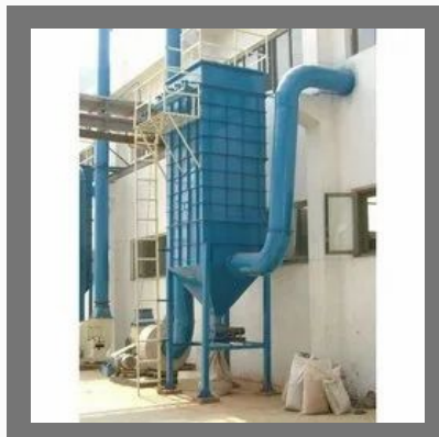
Insertable Bag Filter