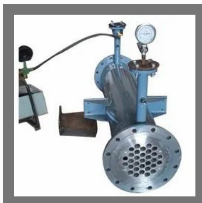
Tube Heat Exchanger