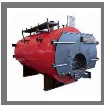
Electric Hot Water Generator