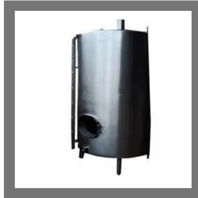
Stainless Steel Water Tank