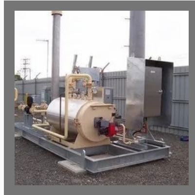
Hot Water Boiler