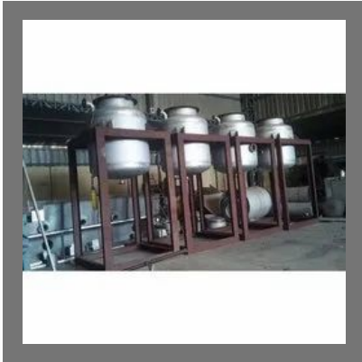
SS Milk Storage Tank