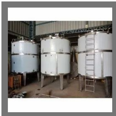
SS CIP Tank