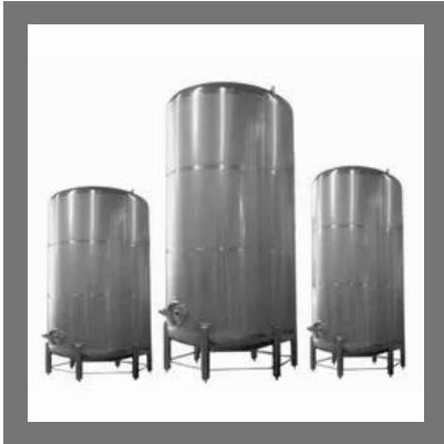
Vertical Oriented Milk Storage Tank