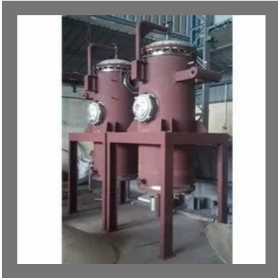
MS Dust Collector