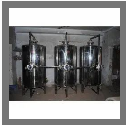
Milk Processing Plants