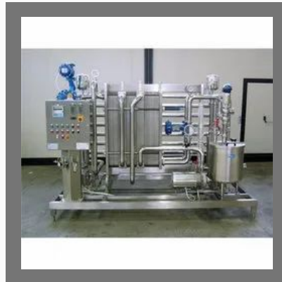
Mini Dairy Plant