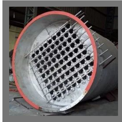
Round Back Dust Collector