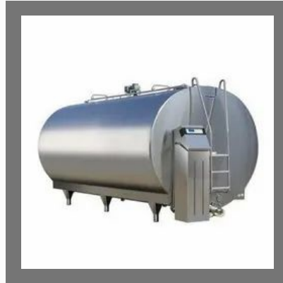
Milk Storage Tank