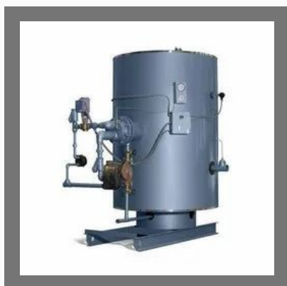
Hot Water Generators