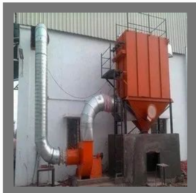
Pulse Jet Bag Filter