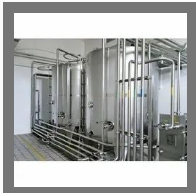
Commercial Milk Processing Plant