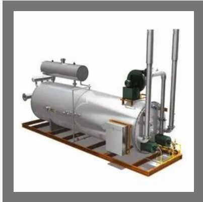
SS Hot Water Boilers