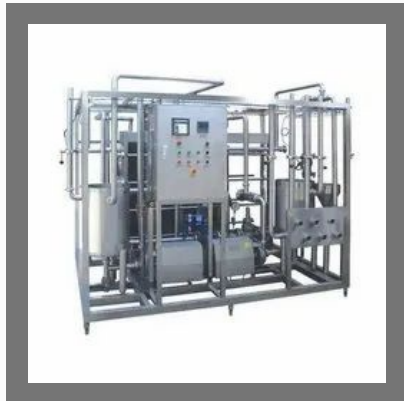
Automatic Dairy Processing Plant