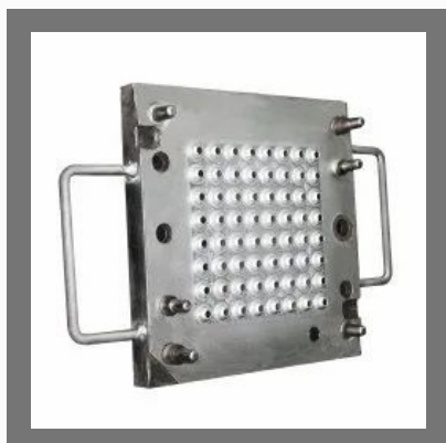
Die Bush Mould