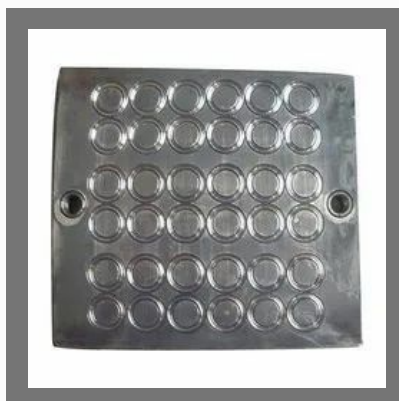
O Ring Mould