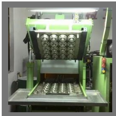
Oil Seal Mould