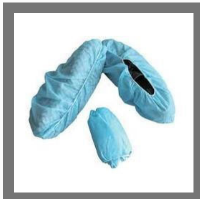
Non Woven Shoe Cover