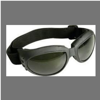
Gas Welding and Cutting Dust Safety Goggles