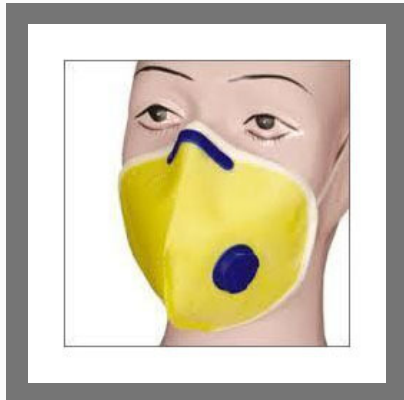
Matty Cloth Nose Mask