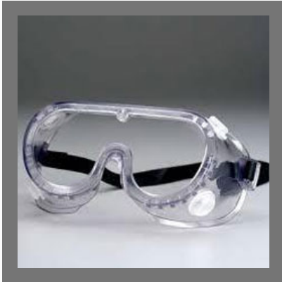
Chemical Splash Goggles