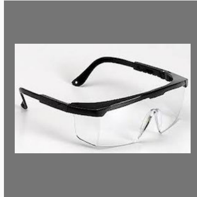
Eye Shield Safety Goggles