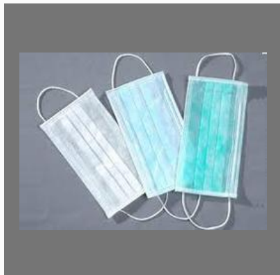
Non Woven Mask