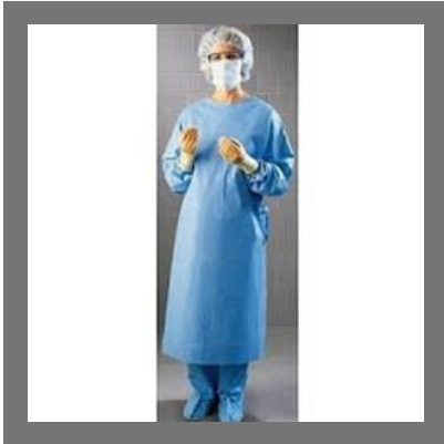
Ultra Protection Gown