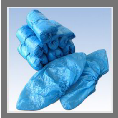
Plastic Shoe Cover