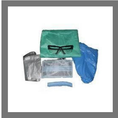
HIV Surgery Gown Kit