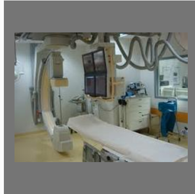
Cath Lab Kit