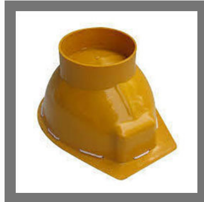
Loader Head Guards