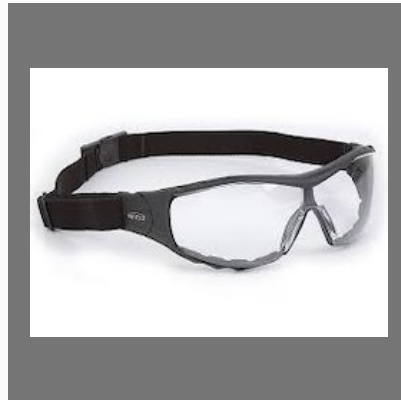
Grinding Safety Goggles