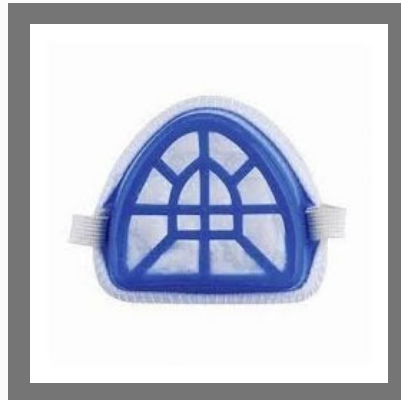
PVC Dust Mask