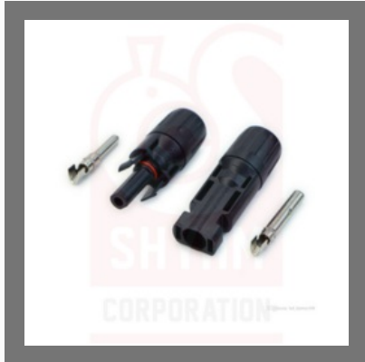
TUV Approved Solar MC4 Connector