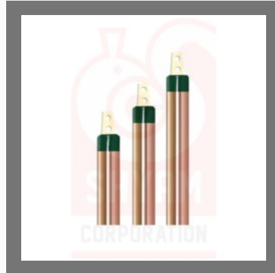
2 mtr Copper Chemical Earthing Electrode