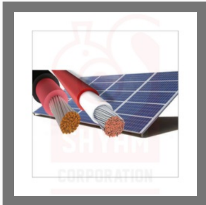
2.5 Sqmm Solar TUV Tinned Copper DC Cable