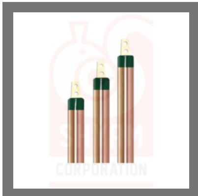
1 mtr Copper Chemical Earthing Electrode