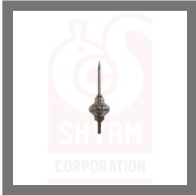
ESE Lightning Arresters