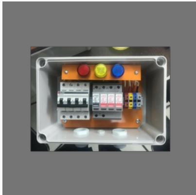
Ac Distribution Box For Three Phase System Acdb 5kw To 15kw Solar System