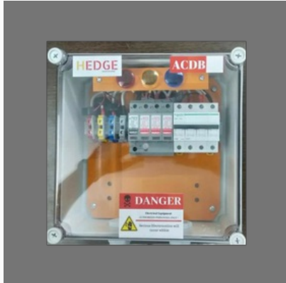
AC Distribution Box for three phase system acdb 10kW to 20kW