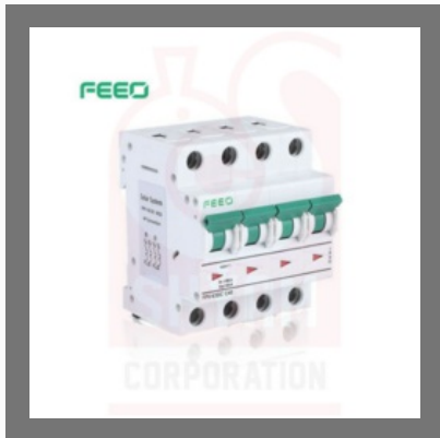
32 Amp 1000V DC Solar Miniature Circuit Breaker