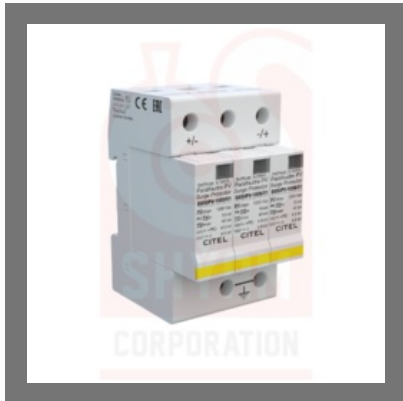
1000V DC Type 2 PV Surge Protection device (SPD) citel