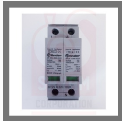
Finder 1 Phase AC Surge Protection Device / Spd