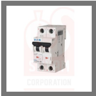
16 Amp 500 V DC Miniature Circuit Breaker