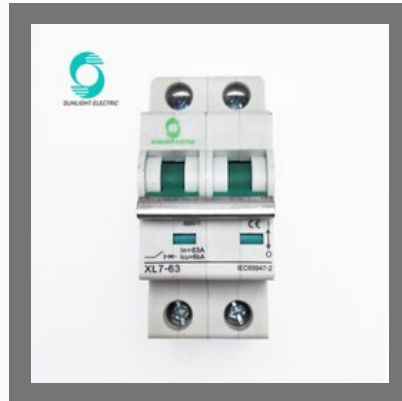
16 Amp 800V DC Solar Miniature Circuit Breaker