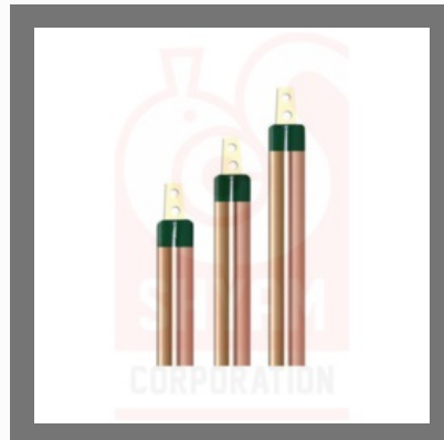
3 mtr Copper Coated Earthing Electrode