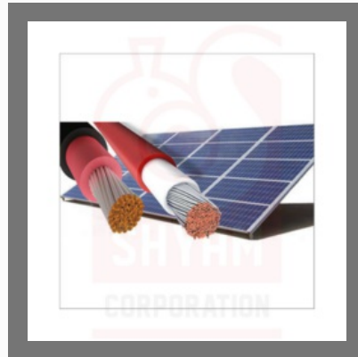
6 Sqmm Solar DC Cable TUV Tinned Copper