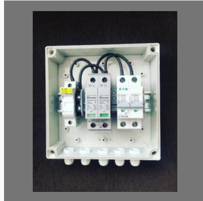
DC Distribution Box 1 IN 1 OUT DCDB 1kW to 4kW