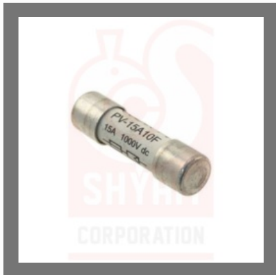
15 Amp 1000V Solar DC Fuse Eaton Bussmann