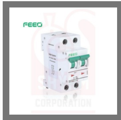
32 Amp 800V DC Solar Miniature Circuit Breaker