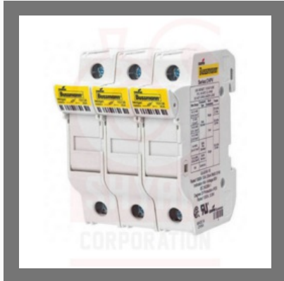
30A 1000V DC Fuse Holder EATON BUSSMANN