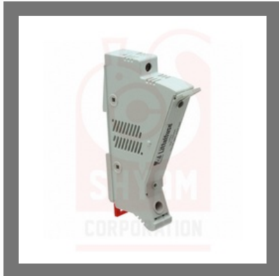
1500V DC Photovoltaic Solar Fuse Holder