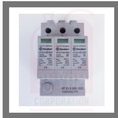
Finder 1000V TYPE2 DC SPD for Solar Application