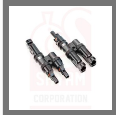
TUV Approved Solar Branch Connector