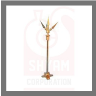
Conventional Lightning Arrester