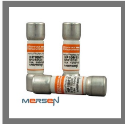
2A 1000V DC Fuse Link