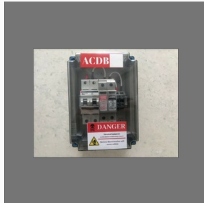
Ac Distribution Box For Single Phase System Acdb 1kw To 5kw Solar System