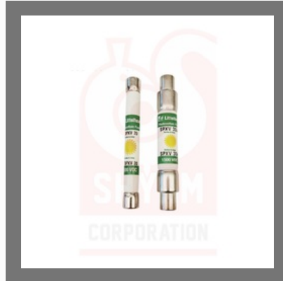
25A 1500V DC Photovoltaic Solar Fuse Littelfuse