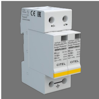
600V DC Type-2 Surge Protection Device (SPD) Citel