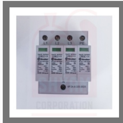
Finder 3 Phase AC Surge Protection Device / SPD