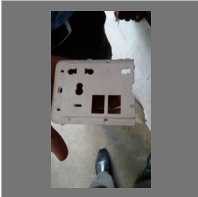
Plastic Mould Electric Switch