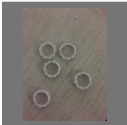
Moulding Machine Parts