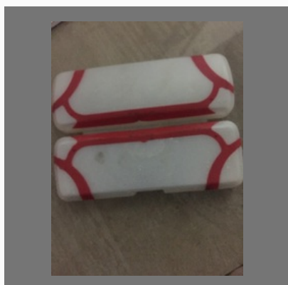
Precision Injection Moulding Parts