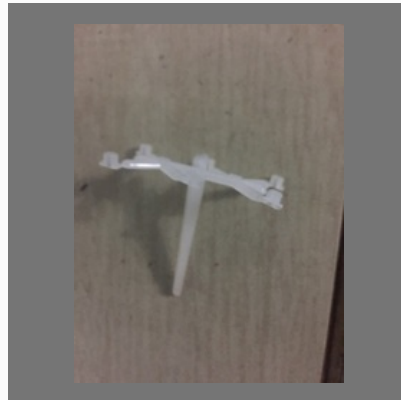
Injection Moulding Machine Parts