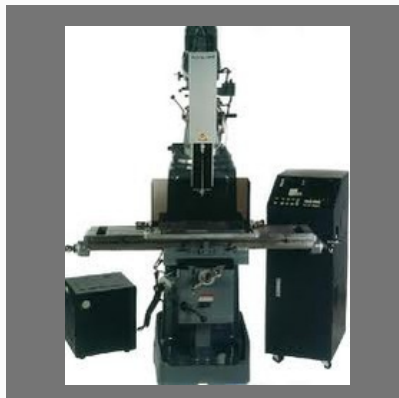
EDM Milling Machine