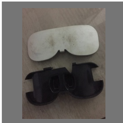
Plastic Moulding Machine Parts