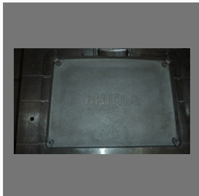
Plastic Injection Mould