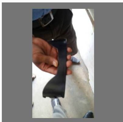
Helmet Die Mold