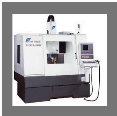
CNC Milling Machine