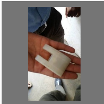
Textile Machinery Parts Molds