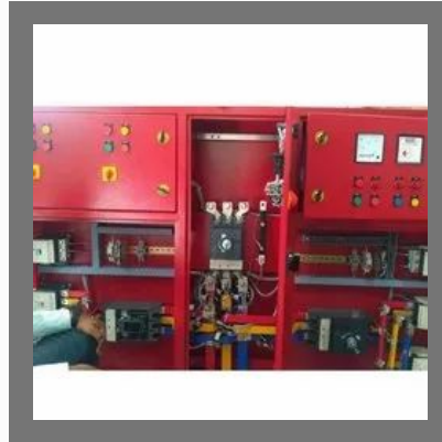
Fire Pump Control Panel