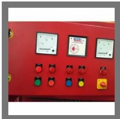
Fire Control Panel