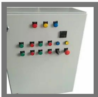
VFD Operated Control Panels