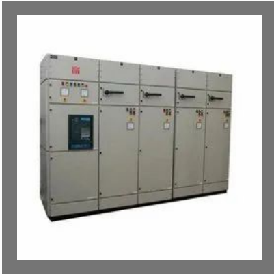
LT Distribution Panel