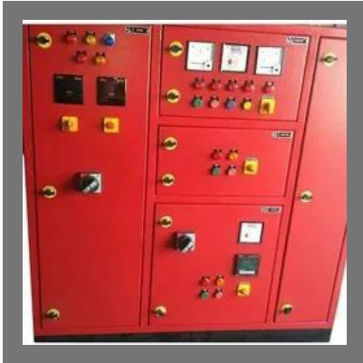
Fire Stater Panel