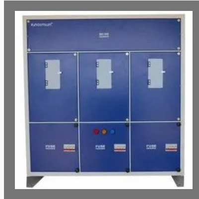
Three Phase Control Panel