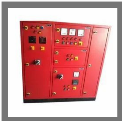
Mild Sheet Fire Pump Control Panel