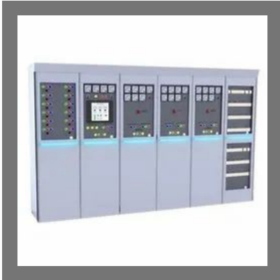
Single Phase Electrical Panels