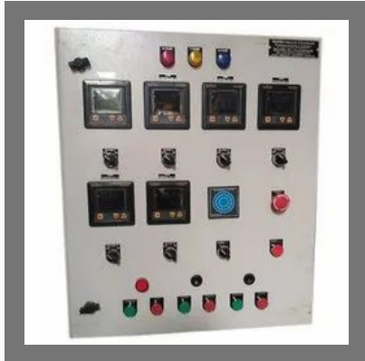
Hetar Power Control Panel