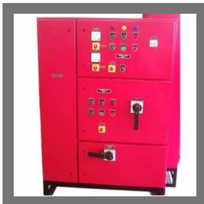
Fire Alarm Control Panel