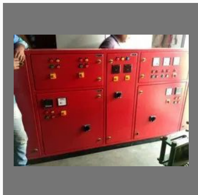
Fire Pump Control Panel