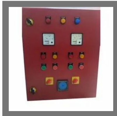
Fire Pump Control Panel For Busal Mol