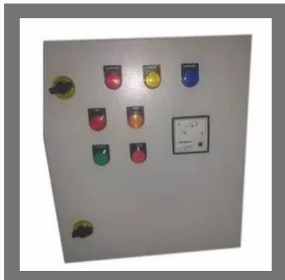
PLC Control Panel