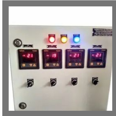
Heat Control Panel