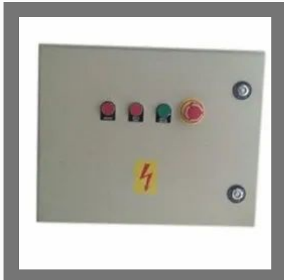
PLC Control Panel