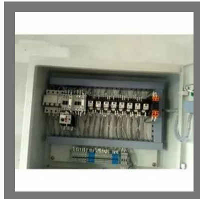
Hoylic Good Lift Control Panel