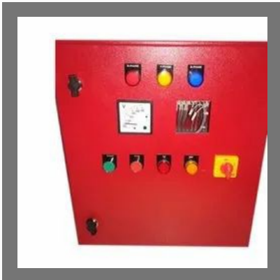
Fire Pump Control Panel