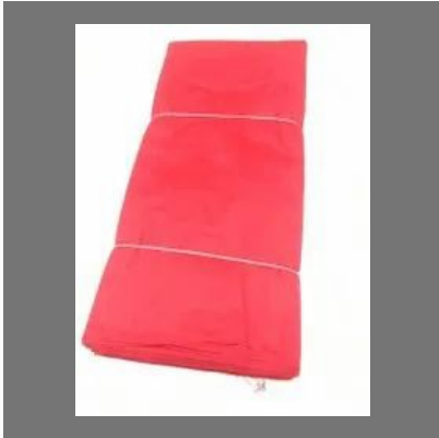
Red Silk Fabric