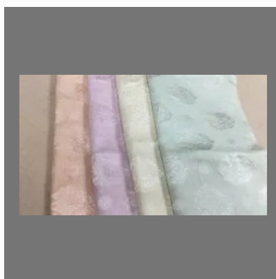
Handloom Satin Linen Jacquard Fabric