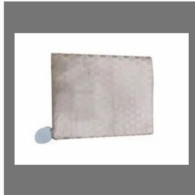
Handloom Silk Jacquard Fabric