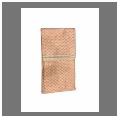
Printed Silk Jacquard Fabric