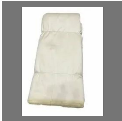
Cream Silk Fabric