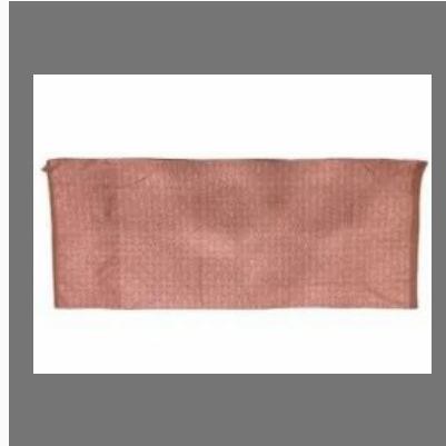
Peach Silk Jacquard Fabric