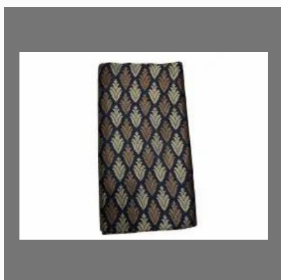
Handloom Muga Silk Fabric