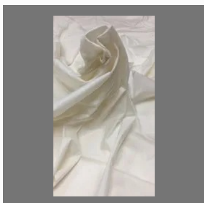
Katan Spun Silk Plain Fabric