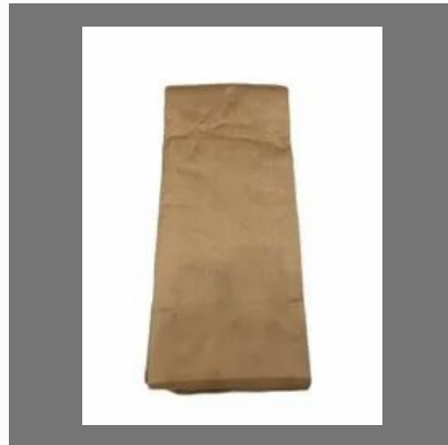
Brown Silk Fabric