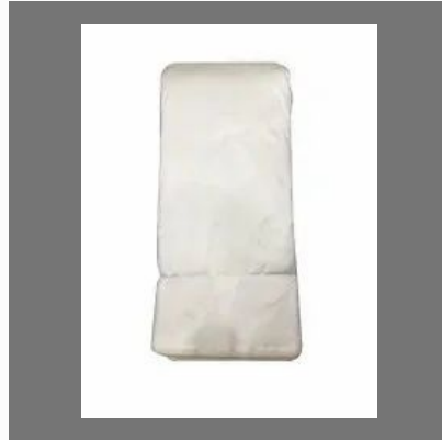
Silk White Fabric