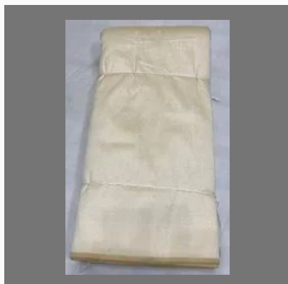
Art Silk Fabric