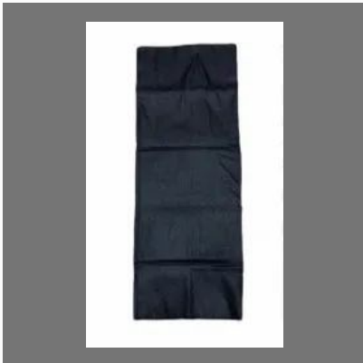
Black Silk Jacquard Fabric