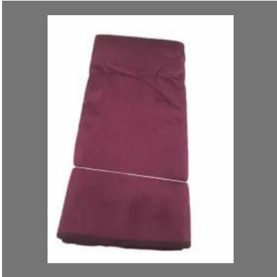
Wine Silk Fabric