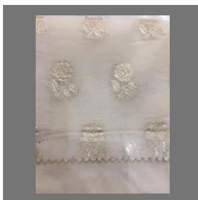
chanderi Fabric dyable with zari