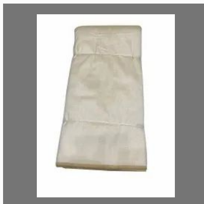
Plain Silk Fabric