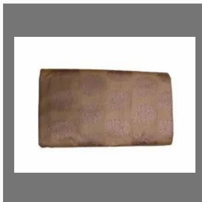
Brown Dyed Cotton Fabric