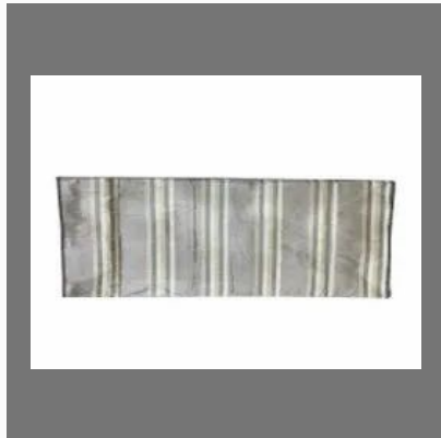
Striped Raw Silk Fabric