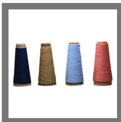
Dyed Linen Yarn