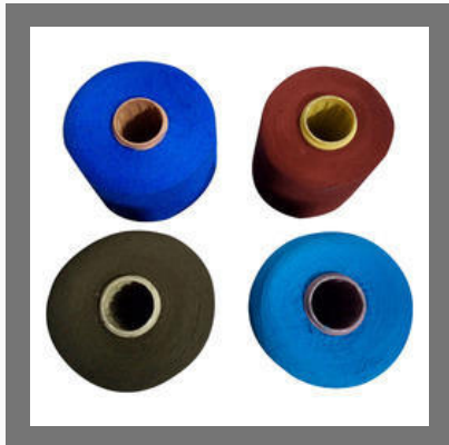
Dyed Polyester Yarn