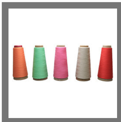
Dyed Tencel Yarn