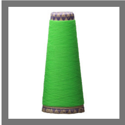
Dyed Green Cotton Yarn