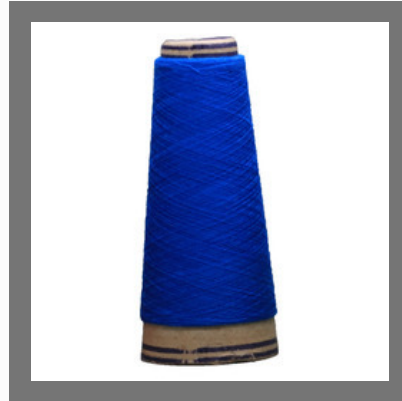
Dyed Blue Cotton Yarn