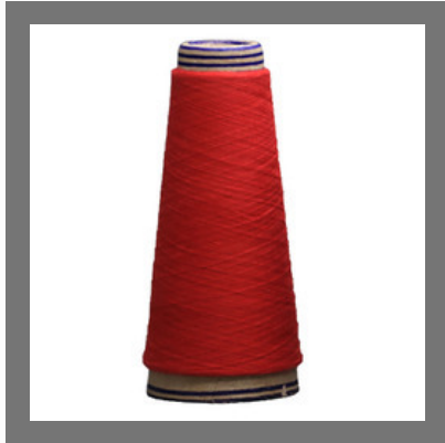
Dyed Red Cotton Yarn