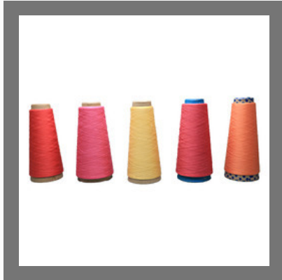
Dyed Modal Yarn