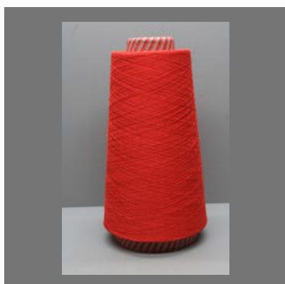
Dyed Cotton Mercerized Yarn