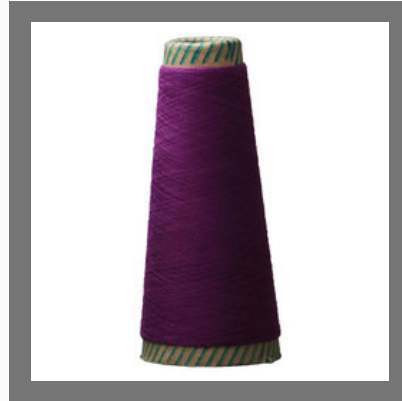
Dyed Violet Cotton Yarn