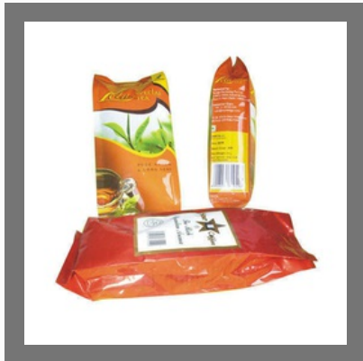
Side Gusset Side Weld Bags