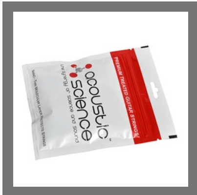
Three Side Seal Pouches