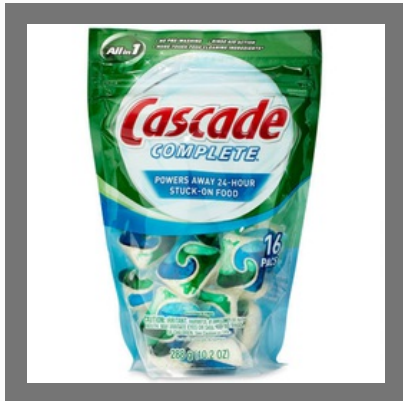
Dish Wash Wrapper