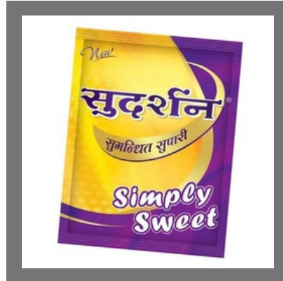
Flavored Supari Pouches