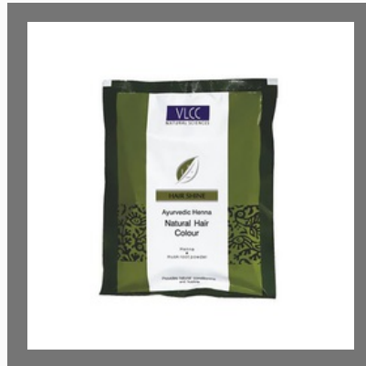
Herbal Care Pouches