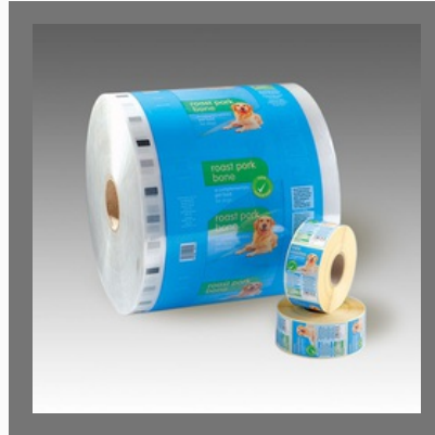
Pet Food Packaging Roll