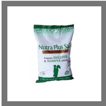
Nutra Plus Pouch