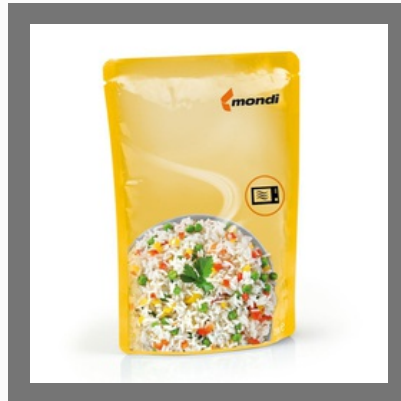
Side Seal Bags With Bottom Gusset