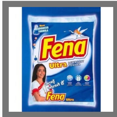
Detergent Powder Packing