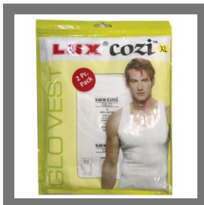
Shirt Packaging Material