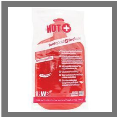
Hot Water Bottle Packing