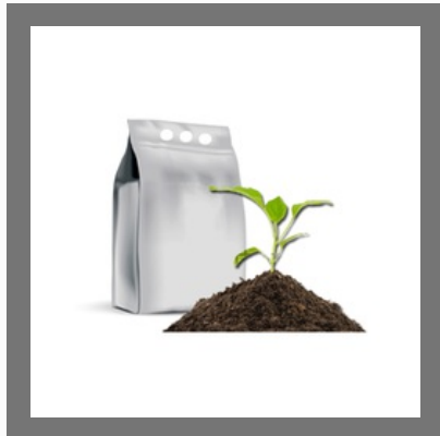
Fertilizer Packaging Bag