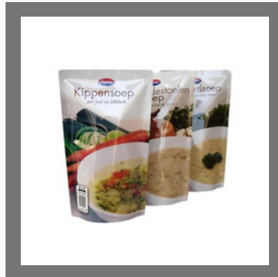
Stand Up Pouches