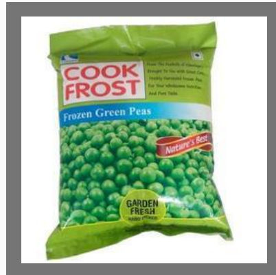
Frozen Food Packaging