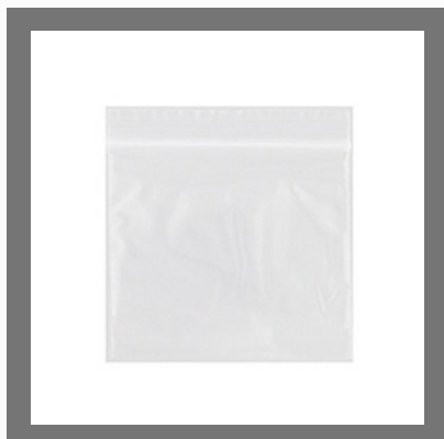
Transparent Pouch with Zip Lock