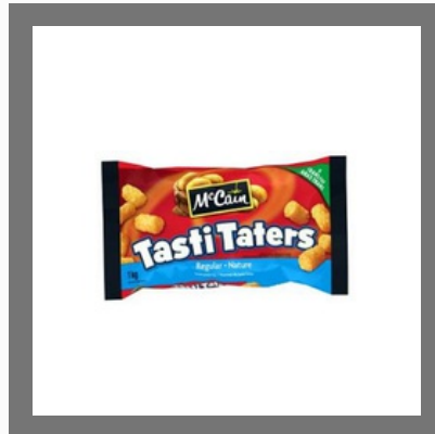
Side Gusset Side Weld Bags