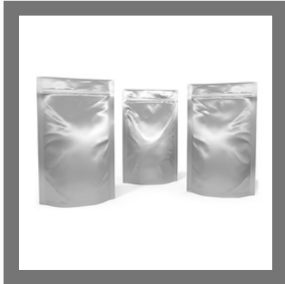
Perforated Zipper Pouch