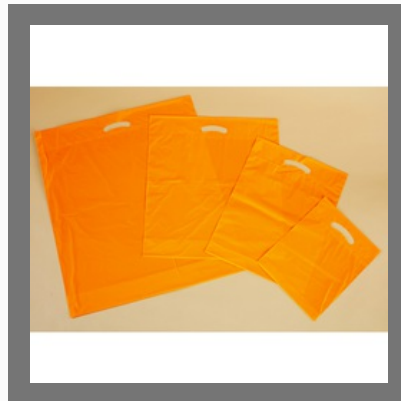
Poly Bags with Gloss