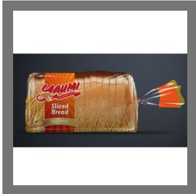
Bakery Packaging Pouches