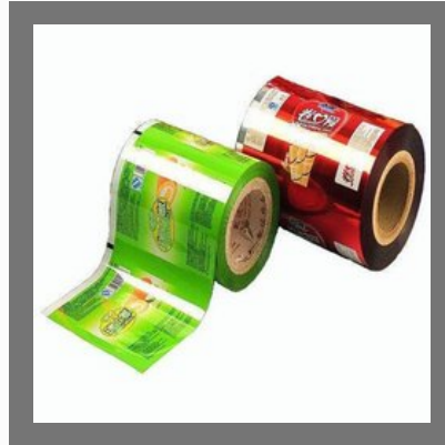
Printed Packaging Rolls