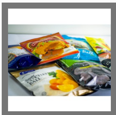
3 Side Seal Pouches