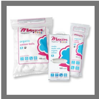
Reusable Cotton Packaging