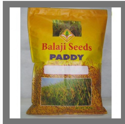
Paddy Seeds Pouch