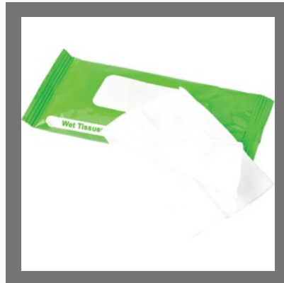
Wet Tissue Pouches