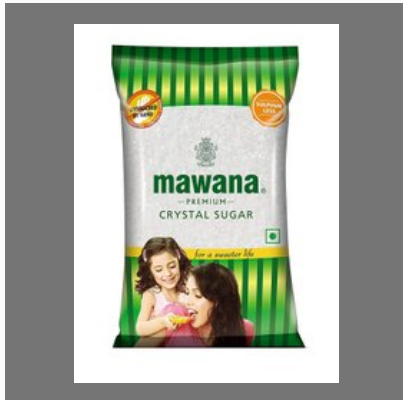
Sugar Packaging Bag