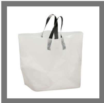
Carry Bags With Special Handles