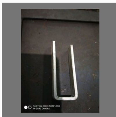
Fan Motor Upper Holder