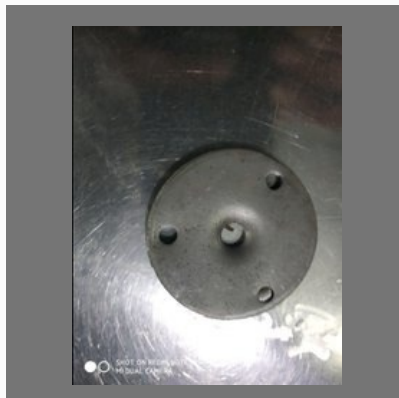
Electrical Fitting Equipment Die