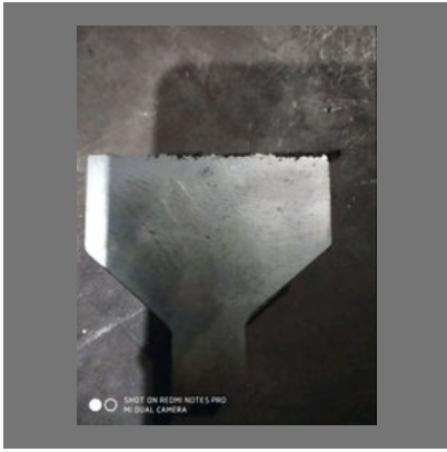
Brush Injection Die