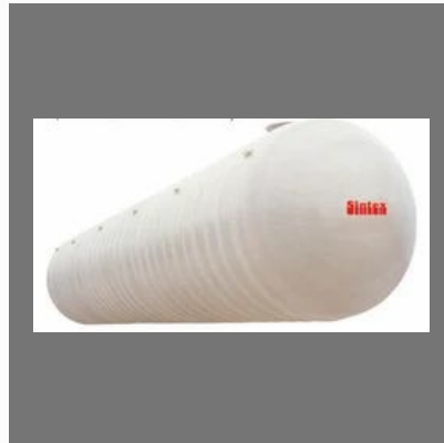
FRP Fuel Tanks