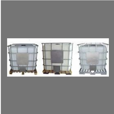
Intermediate Bulk Containers