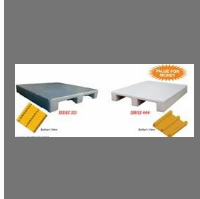
333 & 444 Series Pallets