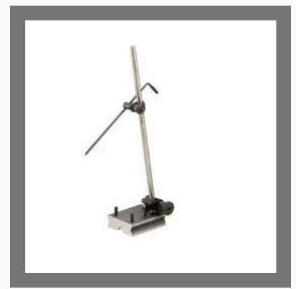
Surface Marking Gauge