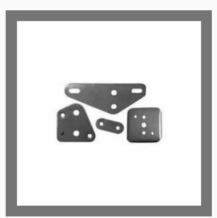
Sheet Metal Pressing