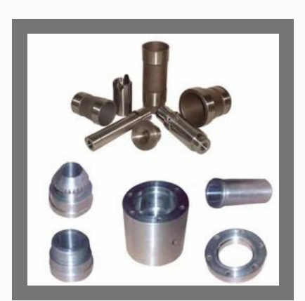
Machined Turned Components