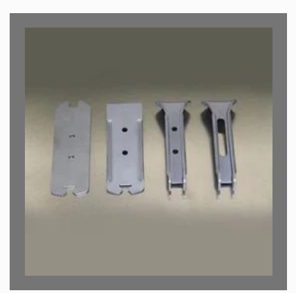
Sheet Metal Precision Pressing Components