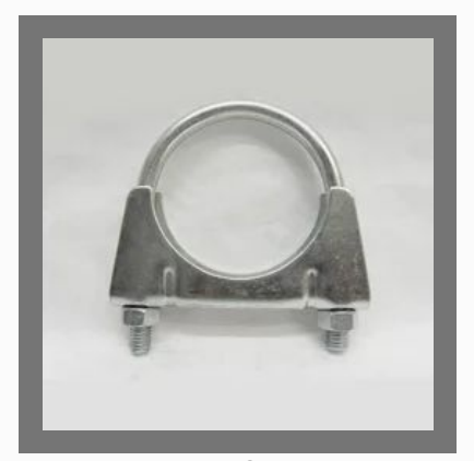
Metal Exhaust Clamp