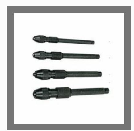
Single Ended Pin Vice