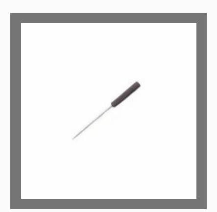
Utility Punch and Scriber