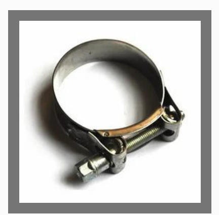
Metal Exhaust Clamp