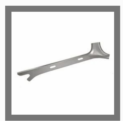
Sheet Metal Pressing Components