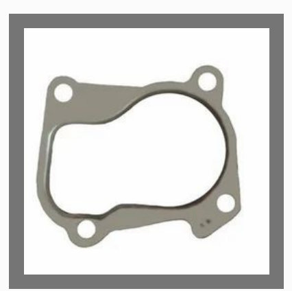
Exhaust System Gasket