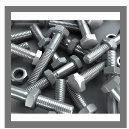
Stainless Steel Bolt & Screws