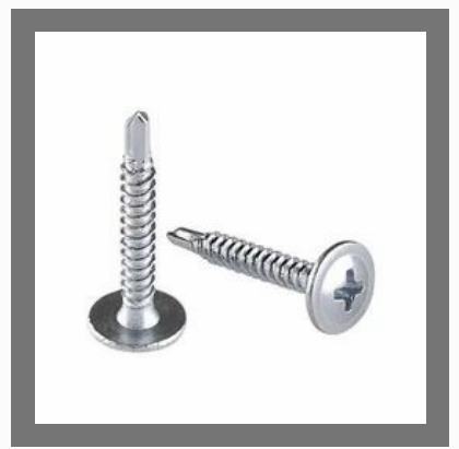
Self Drilling Metal Screws