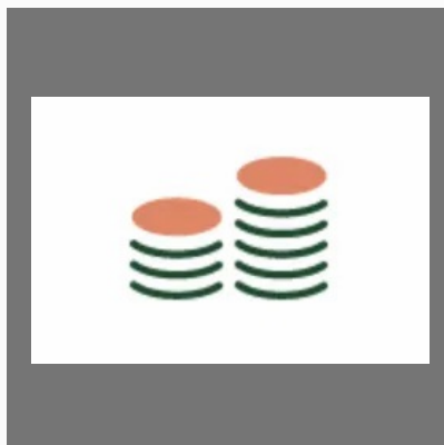
Affordable Pricing Service