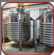
Vapour Liquid Separator