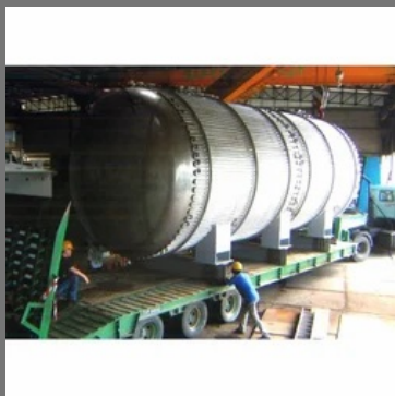
Unfired Pressure Vessel