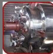
PFR (Plug Flow Reactor)