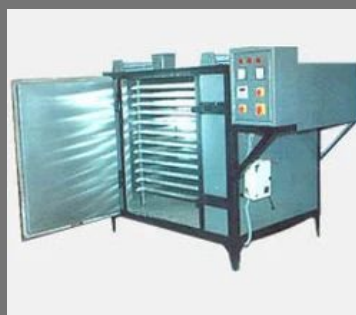
Air Tray Dryer