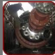
Batch (Batch Reactor Model)