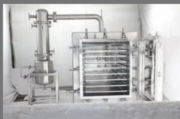
Vacuum Tray Dryer