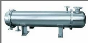
Shell And Tube Type Heat Exchangers