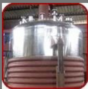
CSTR (Continuous Stirred-Tank Reactor)