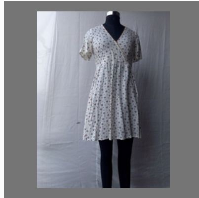
Mill Printed V neck cocktail dress