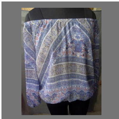
Chiffon printed off shoulder top with full lining