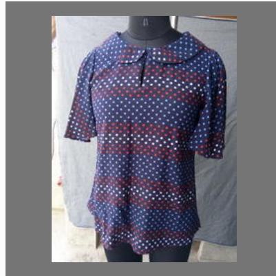
All over border printed thirties rayon tops with falls bell sleeve