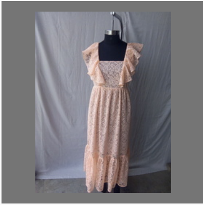
Ladies Designer dress with frilled sleeve