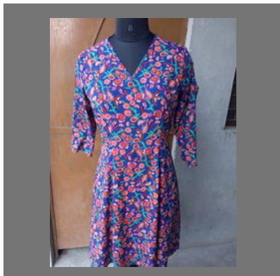
Princess Cut Digital Printed American Crap Dress With Cold Sleeve