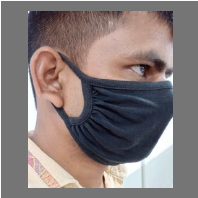
cotton jersey masks