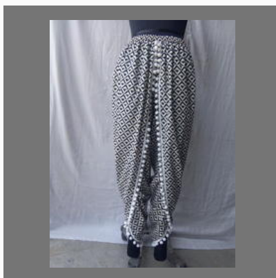
Mill Printed Cotton Dhoti Pant