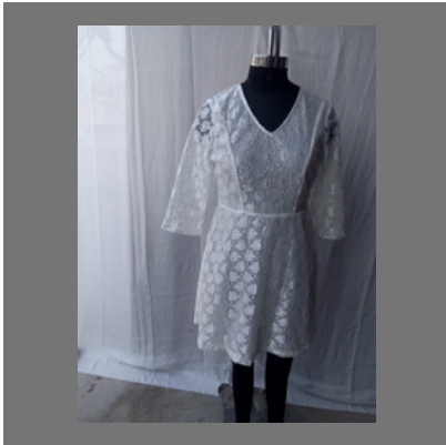
White Lace Dress With Full Lining