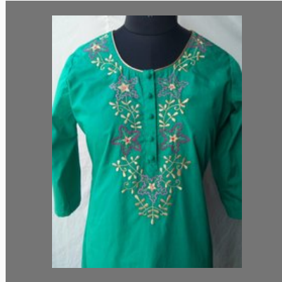
ladies embroadary neck cotton dress