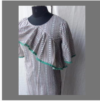
Cotton western frilled with chemical lace Dress