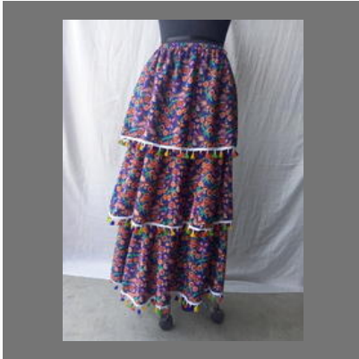
Printed Ladies Three Tear Skirt