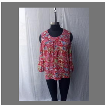
Mill Printed Cotton Crap With Stylish Bell Sleeve Blouse