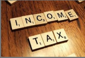
Income Tax Return Filing