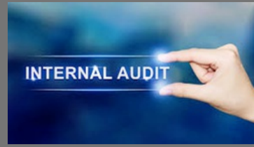
Internal Auditing Services