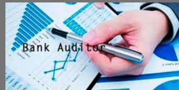
Banking Auditing Services