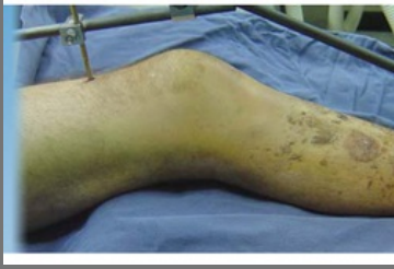
Complex Fractures Treatment Services