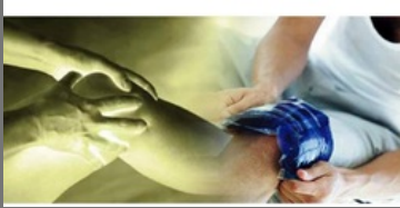
Knee Pain Management Treatment Services