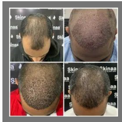
Hair Transplant Service