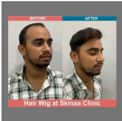
Human Hair Wig