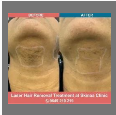
Ladies Laser Hair Removal Service