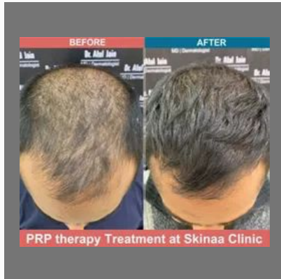
Men Hair Loss Treatment Service