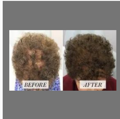
PRP Hair Treatment Service