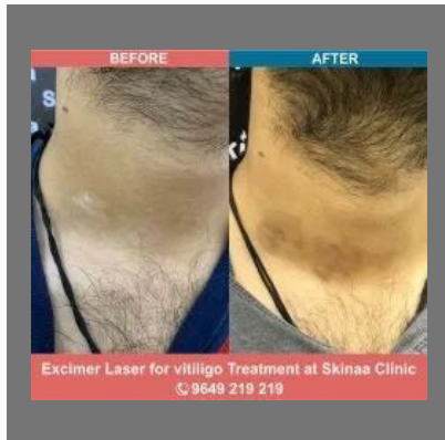
Vitiligo Excimer Laser Treatment Service