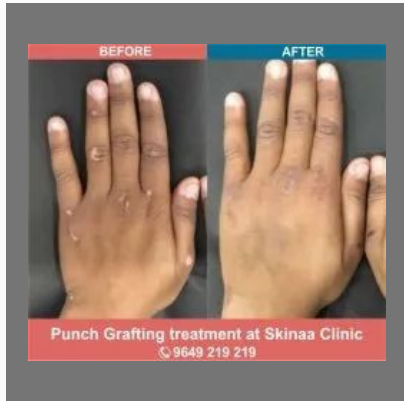
Punch Grafting Laser Skin Treatment Service