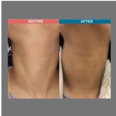
DPN Removal Service