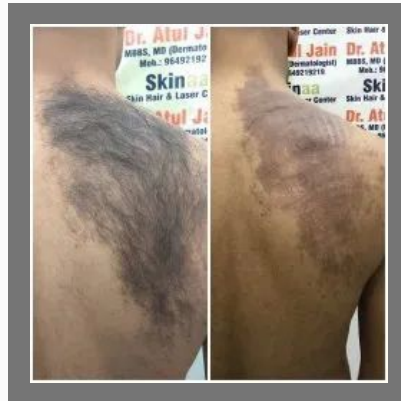
Men Laser Hair Removal Service