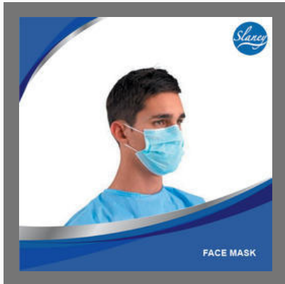
Disposable Surgical Mask