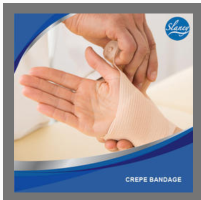
Crepe Bandage 15 x 4