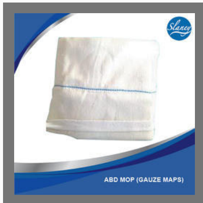
ABD Mop Non Sterile 25X25X8Ply