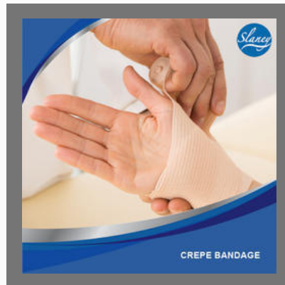
Crepe Bandage 10 x 4