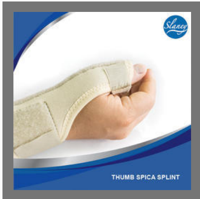
Thumb Spica Splint