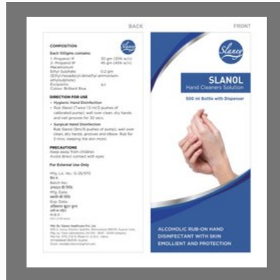
Slanol 500 ml