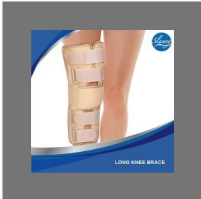
Long Knee Brace