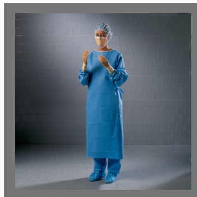
Disposable Surgical Gown