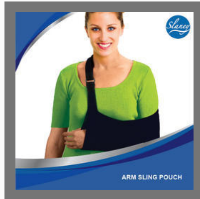
Arm Sling Pouch