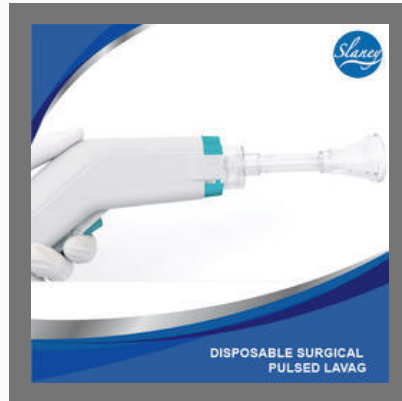
Disposable Pulse Lavage