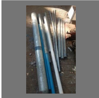
MS Pipe Scrap