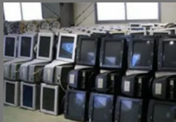
Monitors And LCD Scrap