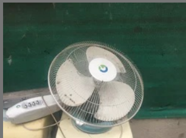
Rolling Table Fan