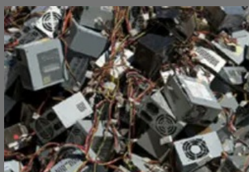
Smps And Power Supply Scrap