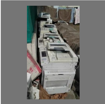
Xerox Machine Scrap