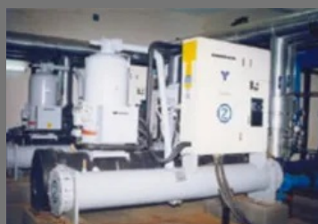
AC Plants Scrap