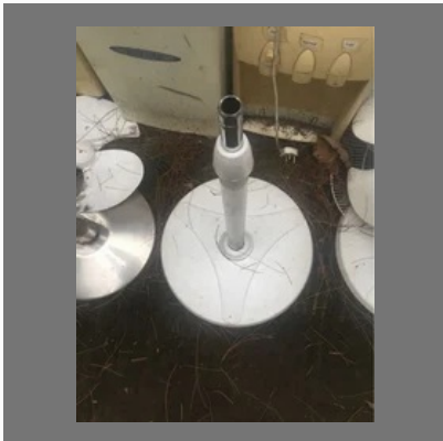
Table Fan Stand