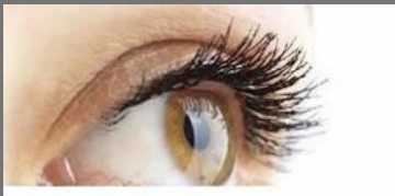
Stitchless Cataract Surgery