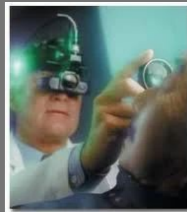
Laser Indirect Ophthalmoscopy