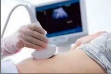
Ultra Sound Scanning