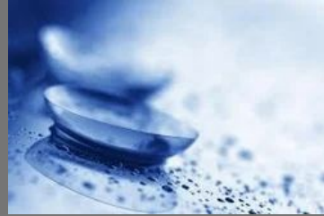
Contact Lens Clinic