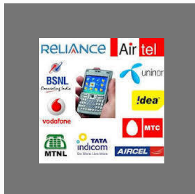
Mobile Recharge Services