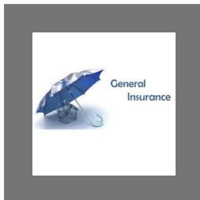
General Insurance Service