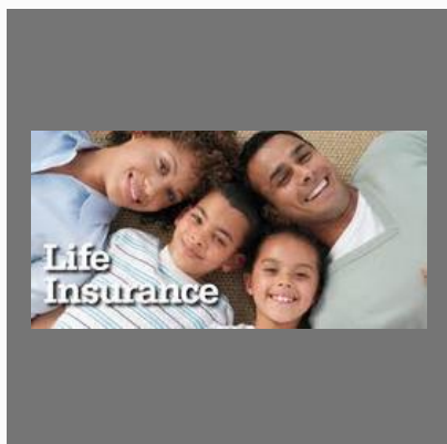
Life Insurance Service