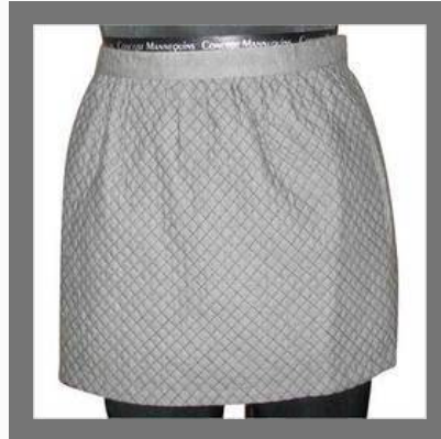
Cotton Wooly Look Quilted Skirts