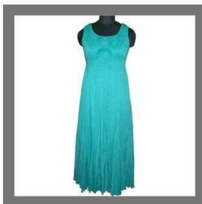
Tape Yoke Dress