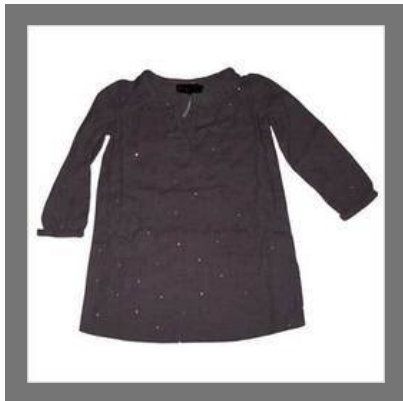
Girls Top With Mukaish Work