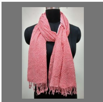
Big Star Prints On Soft Cotton Scarves