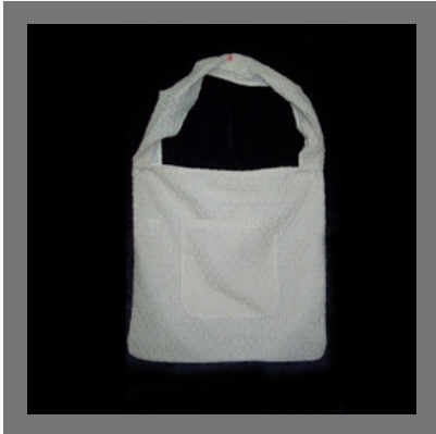
Lace Bags With Solid Lining