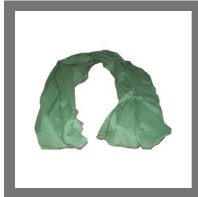
Hand Embroidered Solid Scarves