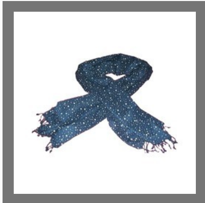
Printed Scarves with Fringes