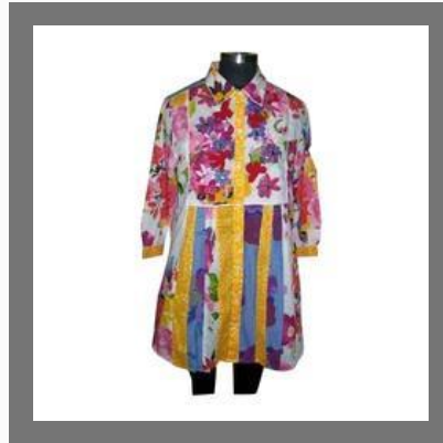
SM Big Embroidery Yoke Shirt