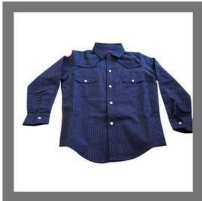
Yarn Dyed Check Shirt With Solid Lining