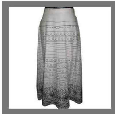
SM Dori Embroidered Skirts