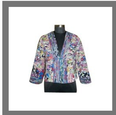
Garden Prints Crafted Jackets