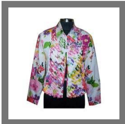
SM Diamond Jacket