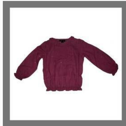
Girls Pleated Top With Mukaish Work