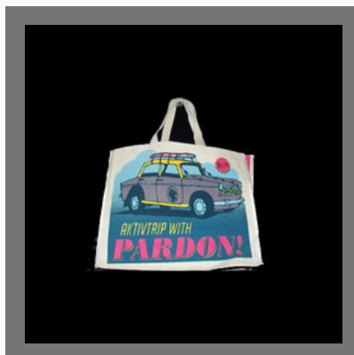
Printed Canvas Bag