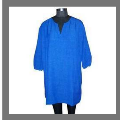
SM Linen Tunics