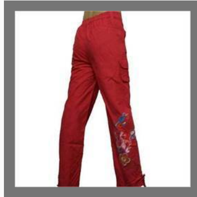
Girls Cargo Pant