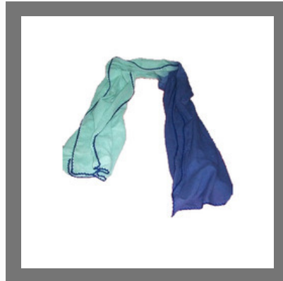
Tie- Dyed Scarves