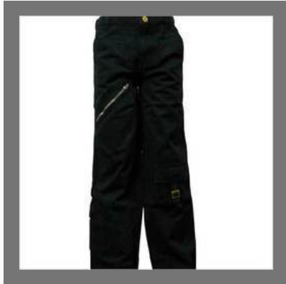
Boys Cargo Full Pant