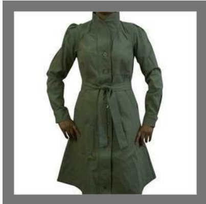
SM PDN Long Coat