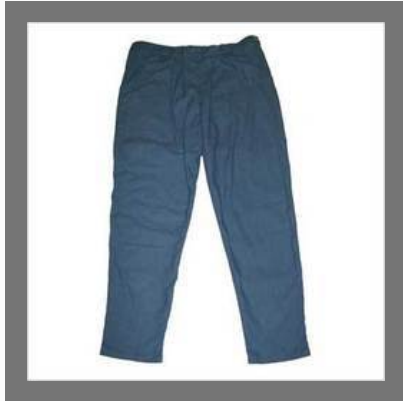
Brushed Cotton Girls Trousers