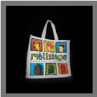
Designer Printed Canvas Bag