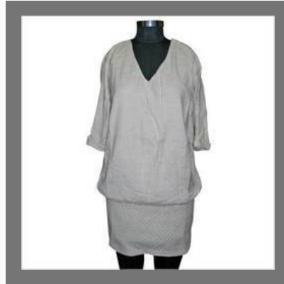
Cotton Wooly Look Quilted Dress