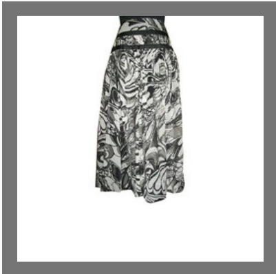
Printed Chiffon Skirt With Waist Ribbon