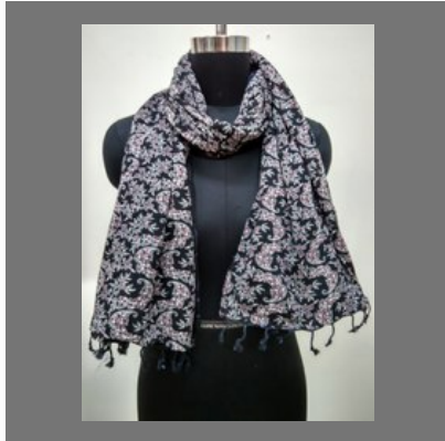
Prints Scarves With Fringes