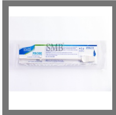
SMB Single Sided Probe With Cursor