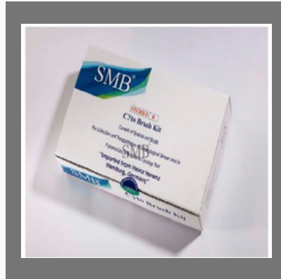
Cyto Brush Kit