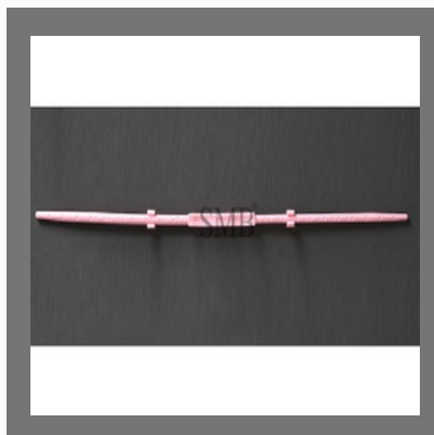
SMB Double Sided Probe With Cursor