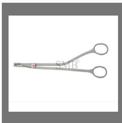
IUD Thread Cutting Scissors