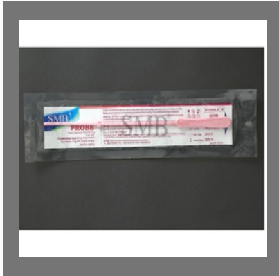
SMB Angled Probe With Cursor