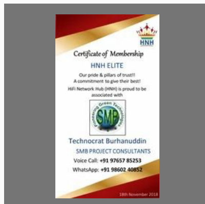
Techno Economic Feasibility