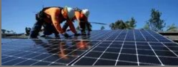
On Grid Solar Installation Service