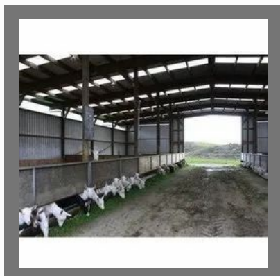
Project Report For Sheep Or Goat Farming