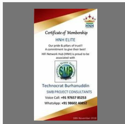
Customised Project Report