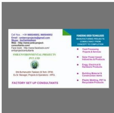
Customized Project Report For Calcium Silicate Manufacturing