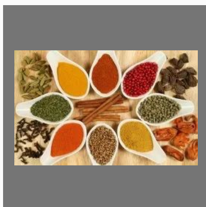
Spices Manufacturing Project Report