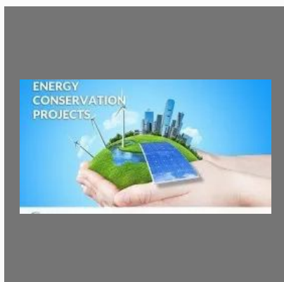
Practical Project Report For Stone Crushing Project