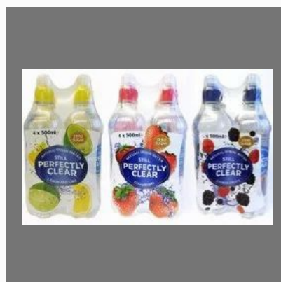
Project Report For Flavored Water