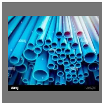
Project Report For PVC Pipes Manufacturing