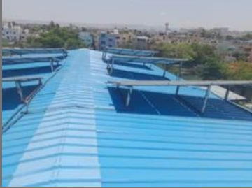
Solar Mounting Structure