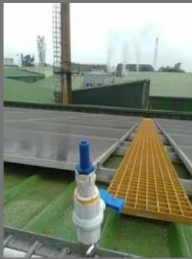
On Grid Solar Power Systems