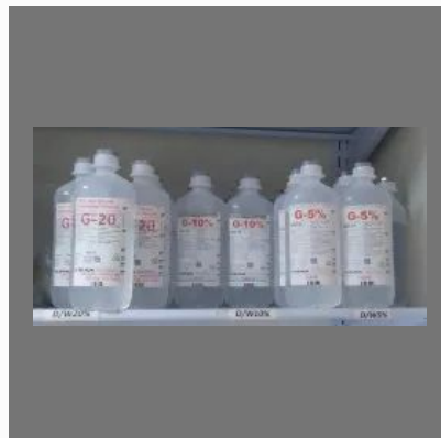
project report for IVF bottles manufacturing