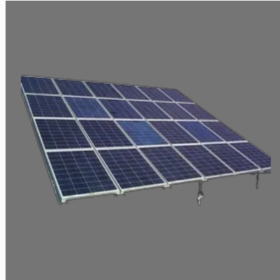
Polycrystalline Solar Panels