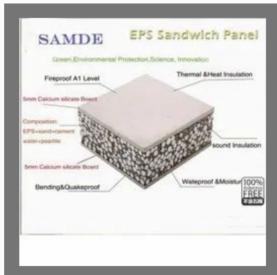
Project Report For EPS Panels