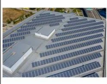
Solar Power Systems