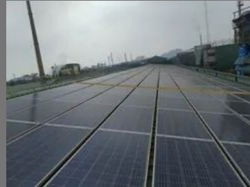
Industrial Solar Roof Top Solar Power System Installation Service