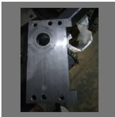
Injection Moulding Die