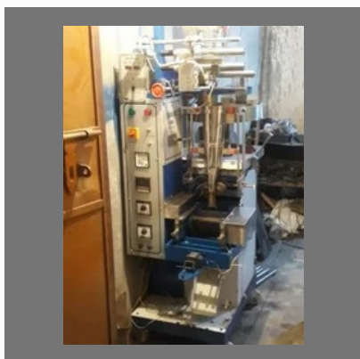
Pouch Packaging Machine