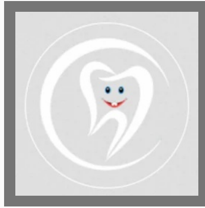
Express Smile Design