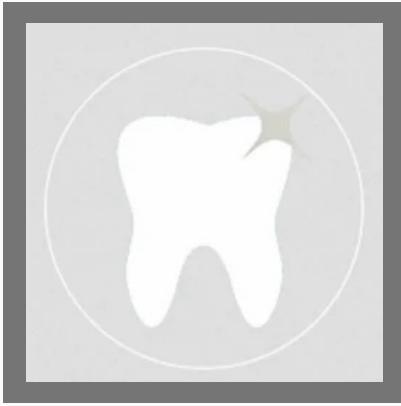
Dentist Root Canal Treatment