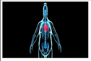
Package For Obesity