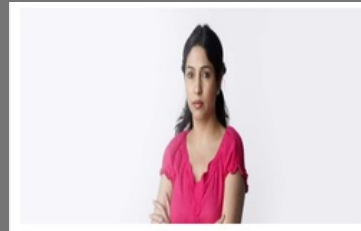
Complete Package for Women