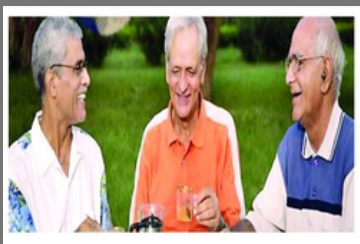
Package For Senior Citizen