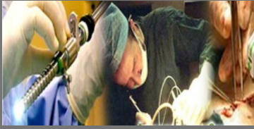
Urological Surgical Packages