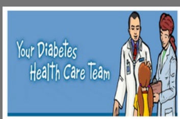
Package for Diabetes