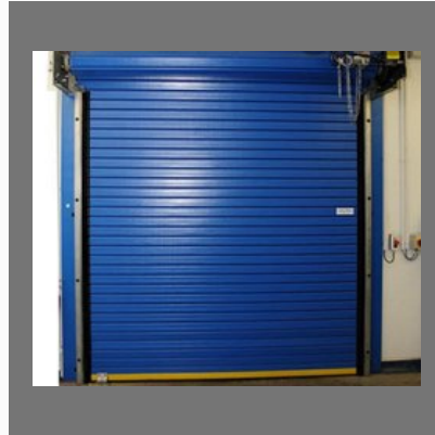
Motorized Rolling Shutter