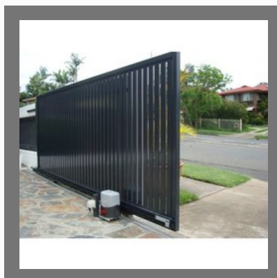
Electric Sliding Gate Motor