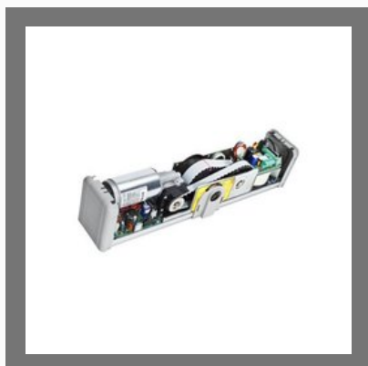
Speed Adjusting Automatic Door Motor