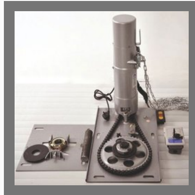
500W Rolling Shutter Motor