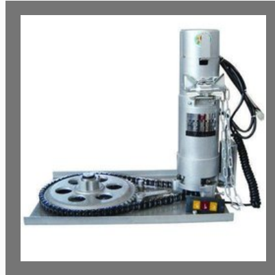
Jielong Rolling Motor