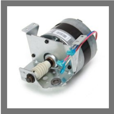
Electrical Operated Roller Door Motor