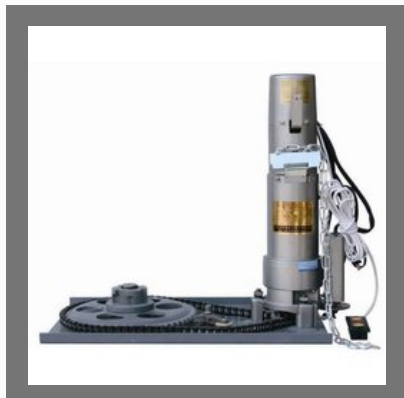
400 W Rolling Shutter Motor