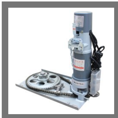
Automatic Door Motor