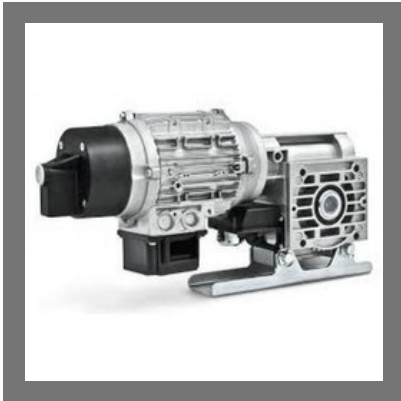
Single Phase Rolling Shutter Motor