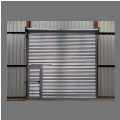
Mini Door Shutter