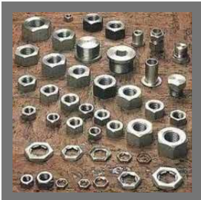
S.S Bolts and Nuts