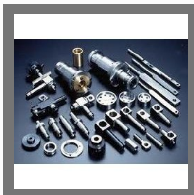
Automobile Press Parts