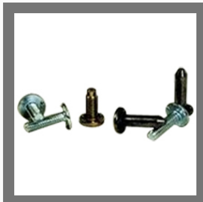
Weld Studs / Copper Coating