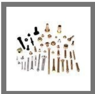
Automobile and Industrial Fasteners