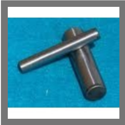
Internal Threaded Dowel Pins