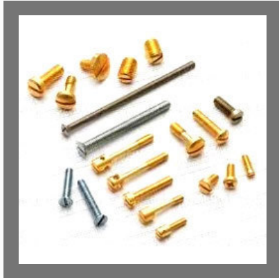
Cold Forged M.S