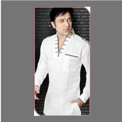
Cotton Raw Material For Fabric