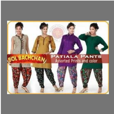
Fabric Raw Material