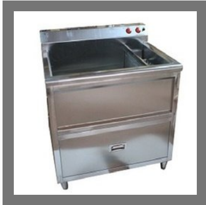
Vegetable/ Fruit Washer Machine With Ozone