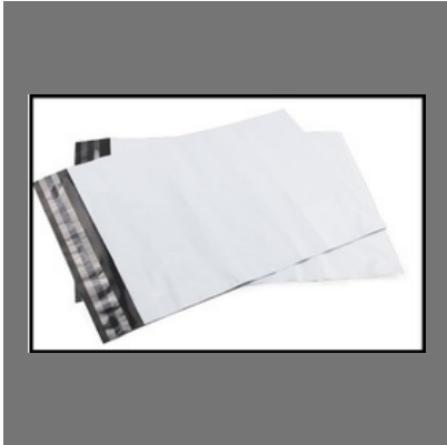
Tamper Proof Courier Bags