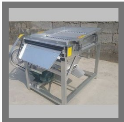
Peas Peeling Machine SPS-95