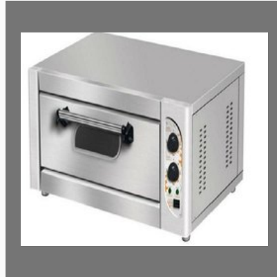
Double Deck Oven Machine