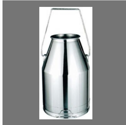
SS Milking Bucket