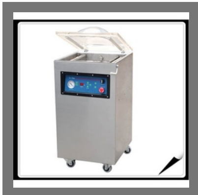
Soya Tofu Vacuum Packing Machine