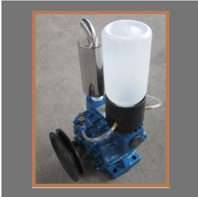
Vacuum Pump For Milking Machine