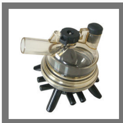
150 CC Milking Machine Claw