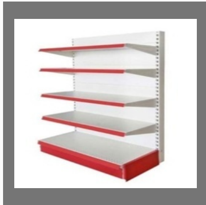
Supermarket Display Rack