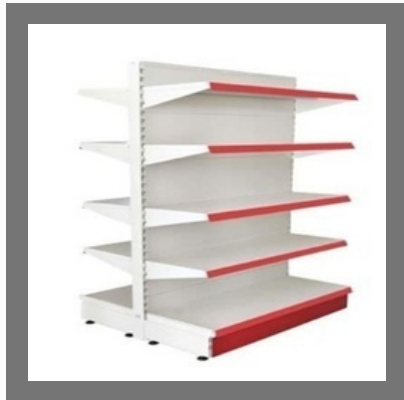
Double Sides Flat Shelf