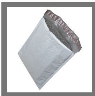
Courier Packaging Bags