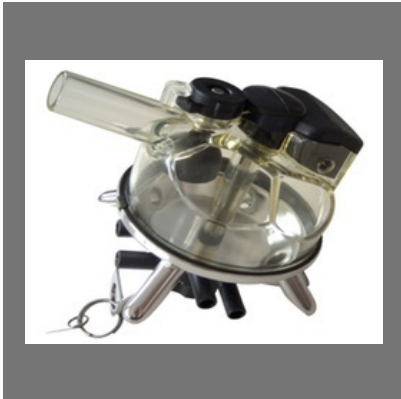
240 cc Milk Claw