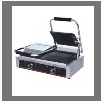
Double Sandwich Griller MB-813