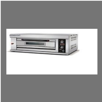
Single Gas Deck Oven Machine