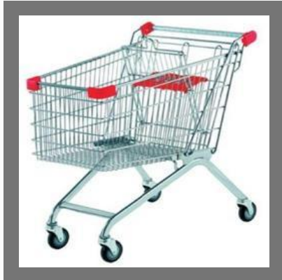
Heavy Duty Shopping Trolley