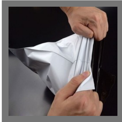
Plastic Courier Bags