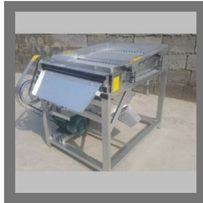
Green Peas Peeling Machine