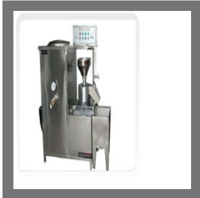
Sps- 100 Soya Paneer Machine