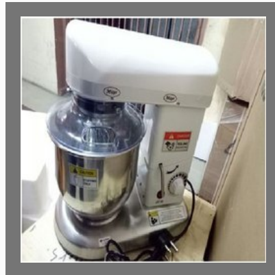
B5 Electric Dough Mixer