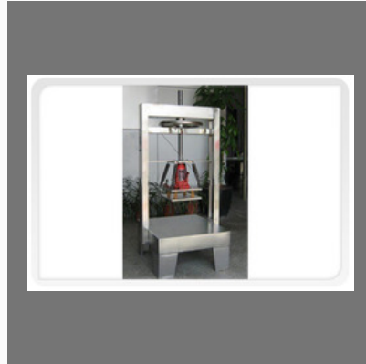
Soya Milk Tofu Pressing Machine