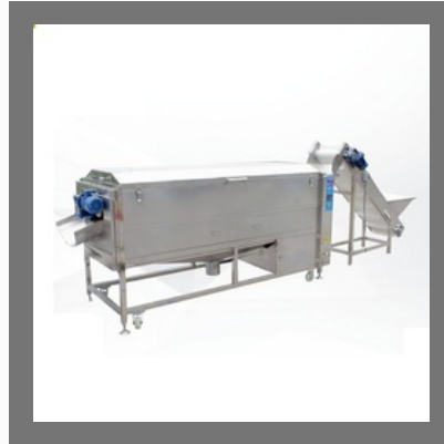
Roots Vegetable Washer And Peeler