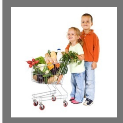
Baby Shopping Trolley