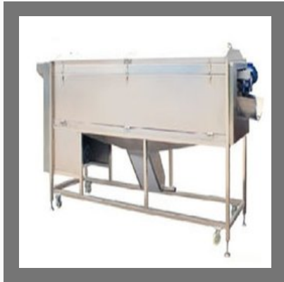
Lxtp- 5000 Roots Screw Vegetable Washer And Peeler