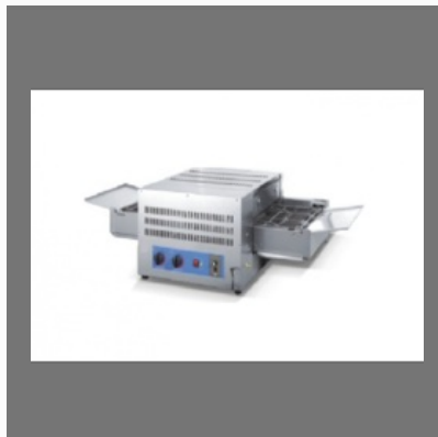
14 pizza oven