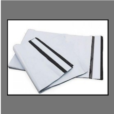
Tamper Proof Bags