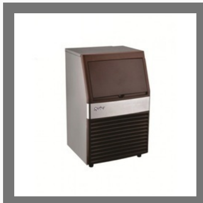
Ice Cube Making Machine (zb-60b)