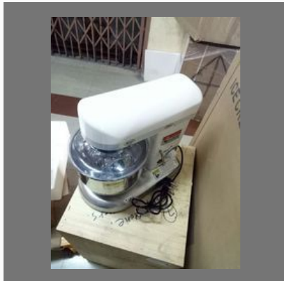
Electric Spiral Mixer