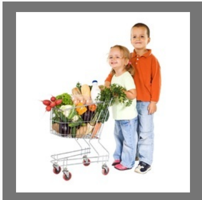
Shopping Trolley for Kids