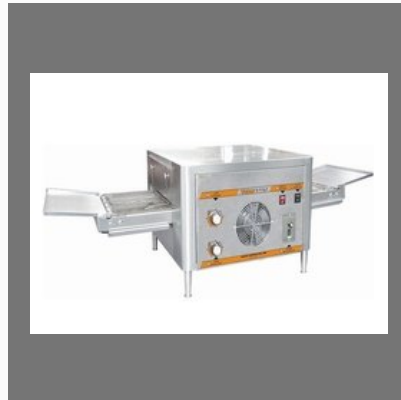
18" Electric Conveyor Pizza Oven