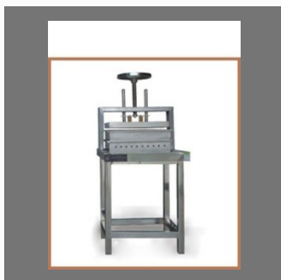
Soya Milk Manual Tofu Pressing Machine