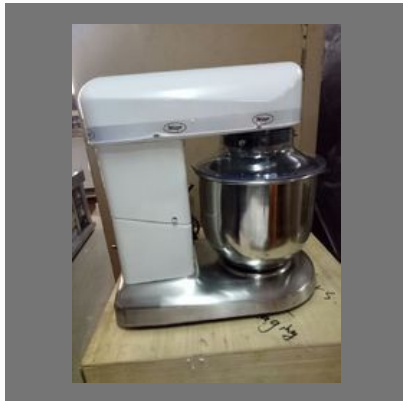
Electric Dough Mixer