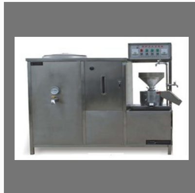
sps- 160 Soya Paneer Making Plant