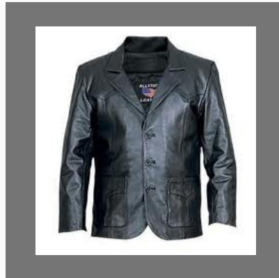
Men's Leather Jacket