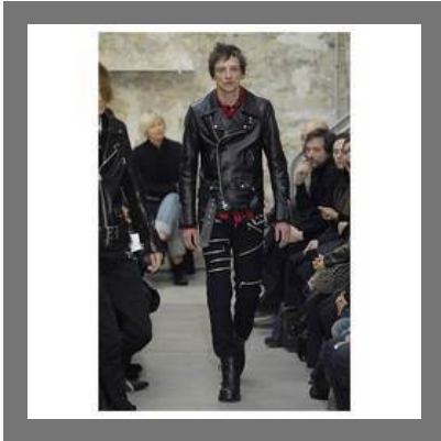
Leather Biker Jacket