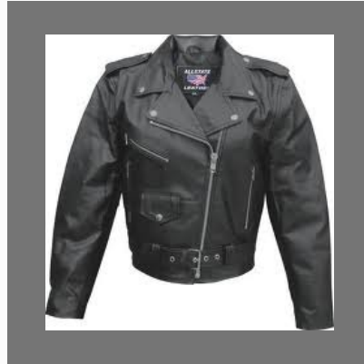
Motorcycle Leather Jacket