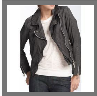
Washed Leather Jackets