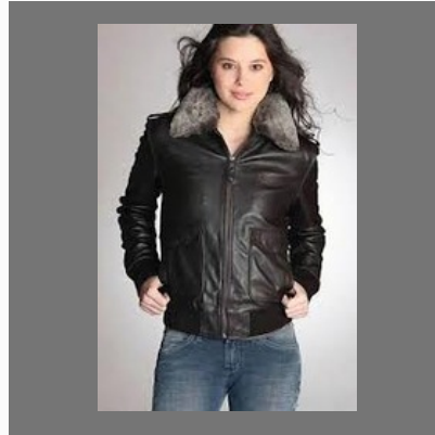
Ladies Leather Blazer