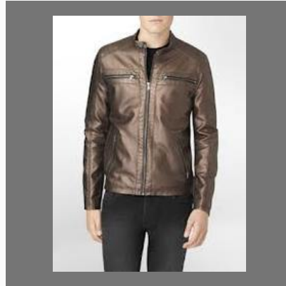
Leather Metallic Finish Jacket