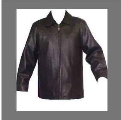
Lambskin Leather Jacket