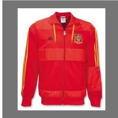
Espana Leather Jacket