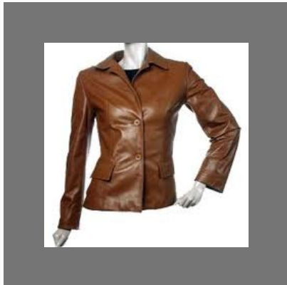
Ladies Leather Jacket