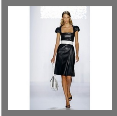
Ladies Leather Dresses