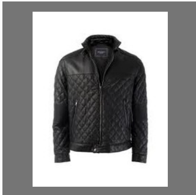
Leather Quilted Jacket