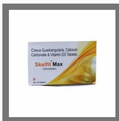
Cissus Quadrangularis, Calcium Carbonate, Vitamin D3 Tablets