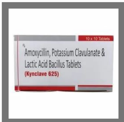
Amoxycillin Potassium Clavulanate Lactic Acid Bacillus Tablets