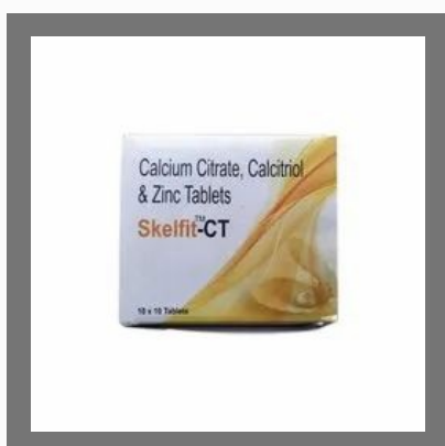
Calcium Citrate Calcitriol Zinc Tablets