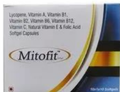
Lycopene ,Multivitamin,Antioxidant Softgel Capsules