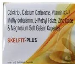
Calcitriol,Calcium Carbonate,Multivitamin Soft- Gel Capsule