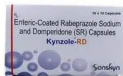
Enteric Coated Rabeprazole Sodium Domperidone SR Capsules