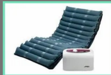
Fluctuating Pressure Air Mattress