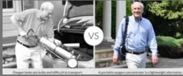
Oxygen Concentrator On Rental Service