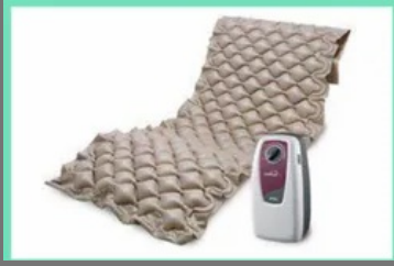
Fluctuating Pressure Bubble Type Air Mattress