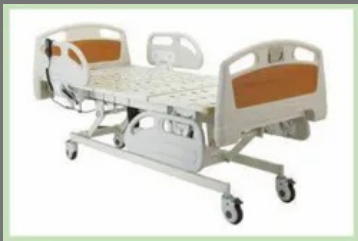
Motorized Hospital Fowler Bed