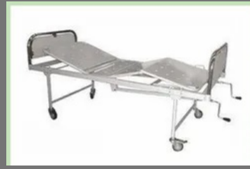
Manual Hospital Fowler Bed