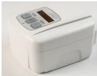
Devilbiss CPAP Machine