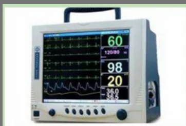
Multipara Patient Monitor