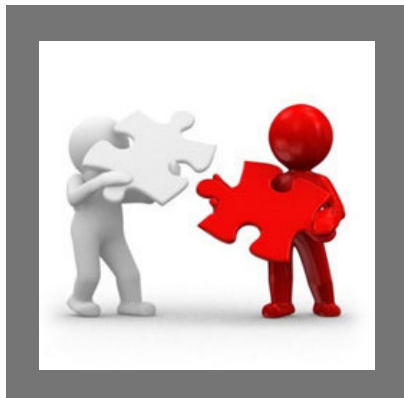
Mergers and Acquisitions (M&A)