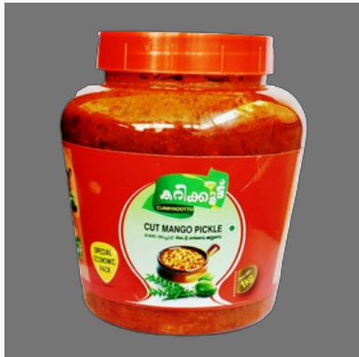
Cut Mango Pickle 1kg