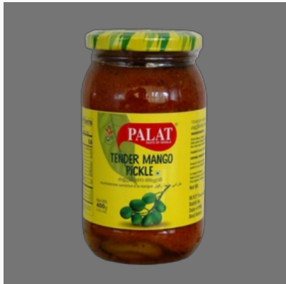
Tender Mango Pickle 400g