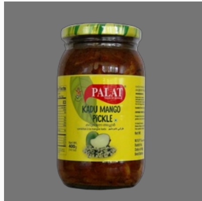
Kadu Mango Pickle