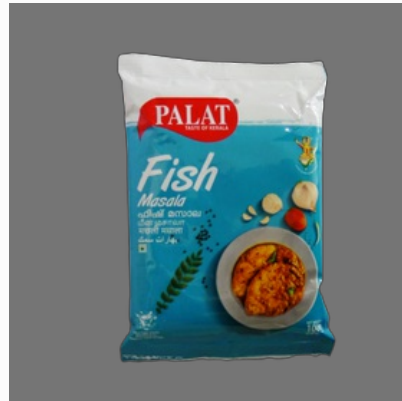
Fish Curry Masala