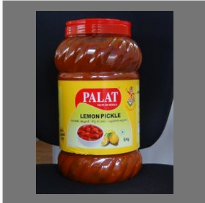
Lime Pickle 5Kg Bottle