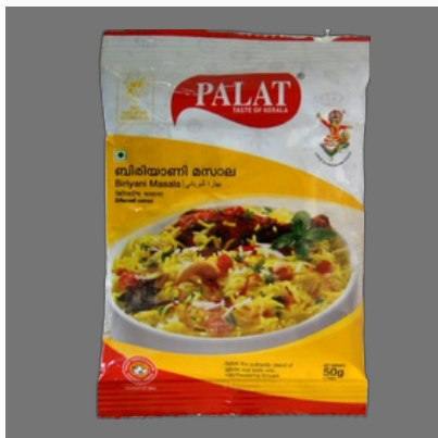
Biryani Masala 50g