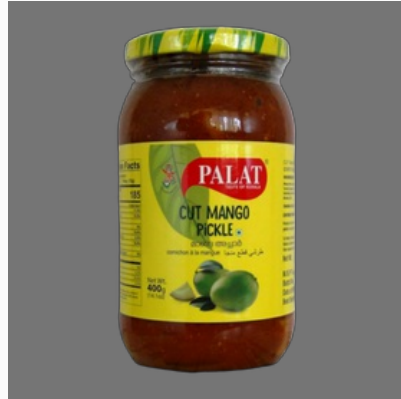
Cut Mango Pickle 400g