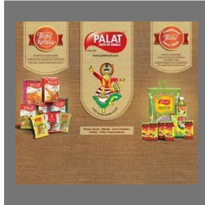
Curry Powders & Pickles