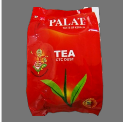
Tea CTC Dust