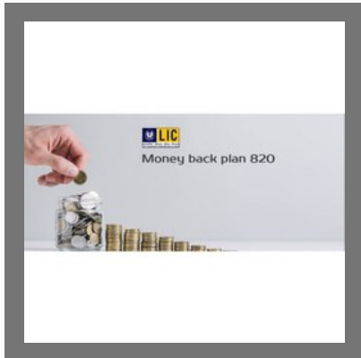
Money Back Plans Service