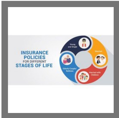
Life Insurance Agents Service