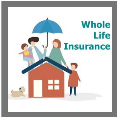
Whole Life Insurance Service