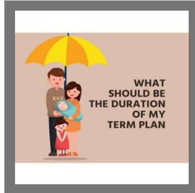
Term Insurance Plans Service