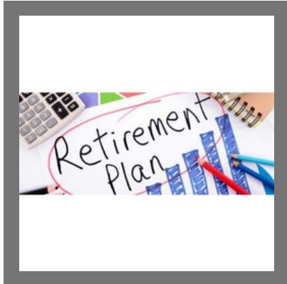
Retirement Planning Service