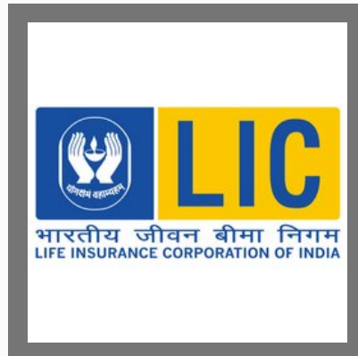
Lic Agent Service