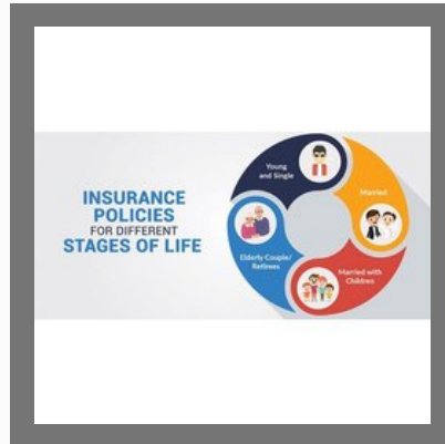
Life Insurance Advisor Service