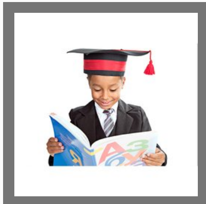
Education Insurance Service