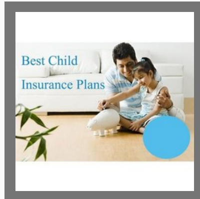
Child Insurance Plan Service