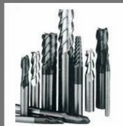
Solid Carbide Cutting Tools