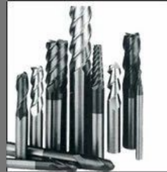
Tungsten Carbide Tool