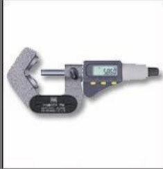
Measuring Screw Thread Measurements