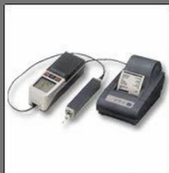
Measuring Surface Roughness