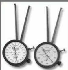
Measuring Outside Dimension