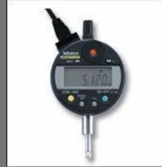
Measuring Step Measurements