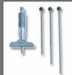
Measuring Depth Gauge