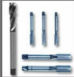
Thread Cutting Tools