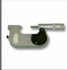
Measuring Comparison Measures