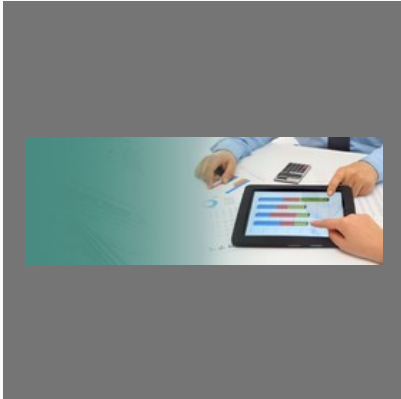
Compliances Within Prevailing Framework of Fast Changing Law