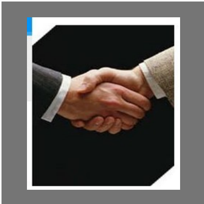
Compliance Within Prevailing Framework of Fast Changing Law