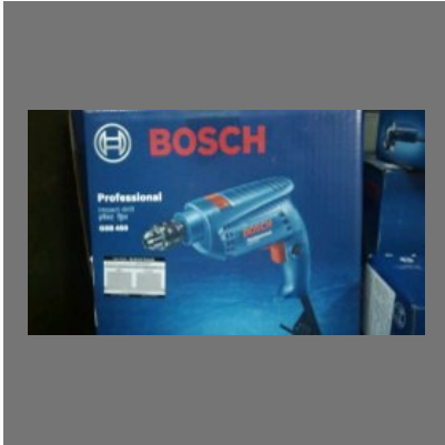
Bosch Drill Machine