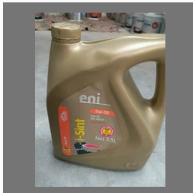
Eni Automotive Oil