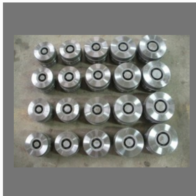
Rubber moulding die