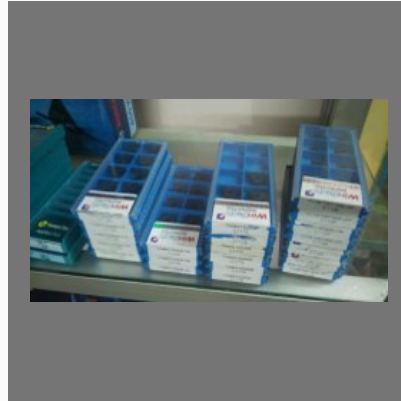
CNC Machine Inserts