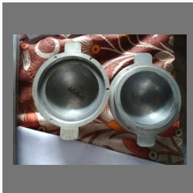
Rubber Ball Moulding Die