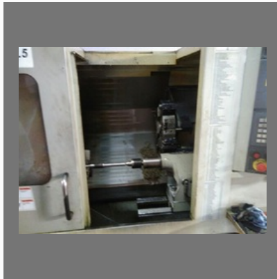
CNC Machine Job Work