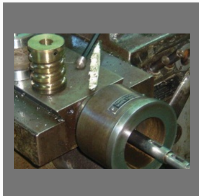
Pressing Tools Tip