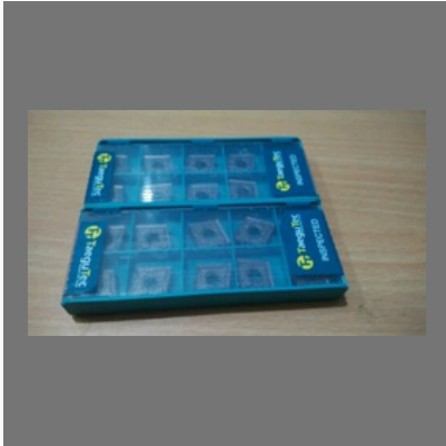
Mill Machine Spares