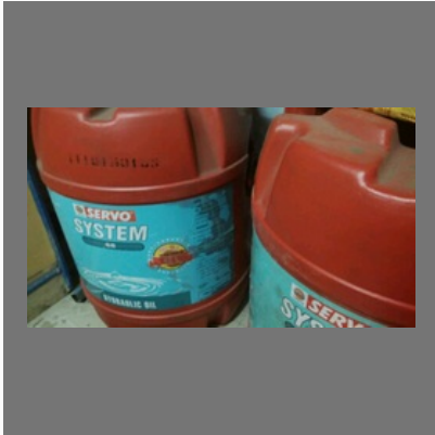
Servo Hydraulic Oil