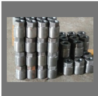
Pressing Tool Tip