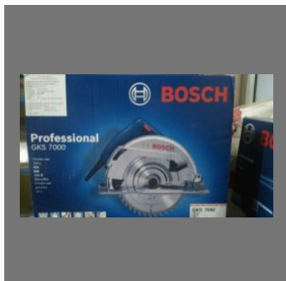
Bosch Professional Gks7000