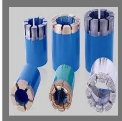
Diamond Core Bit