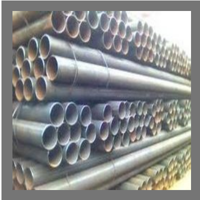
Iron ERW Pipe