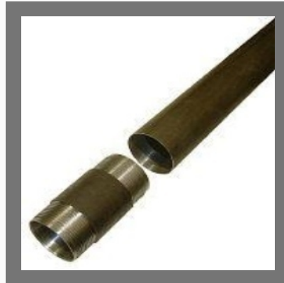
Casing With Coupling