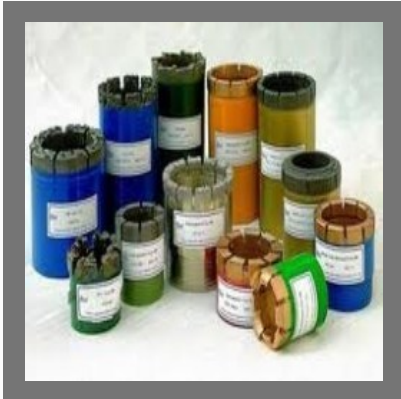
Impregnated & Surface Diamond Core Bit