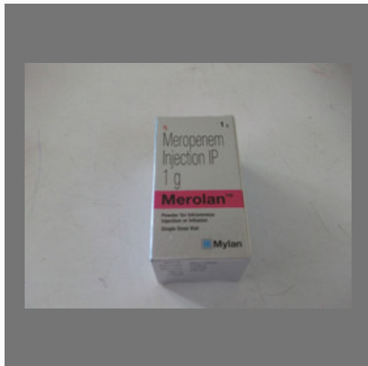
Meropenem 1gm Injection ( Vial)