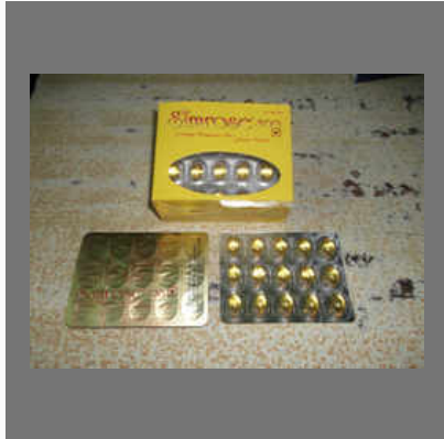
Evening Primrose Oil 500mg Soft Gelatin Capsules