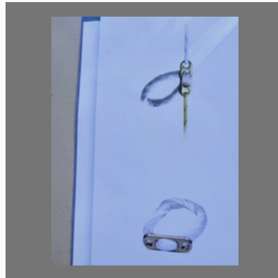
Knee Arthroscopy Implants