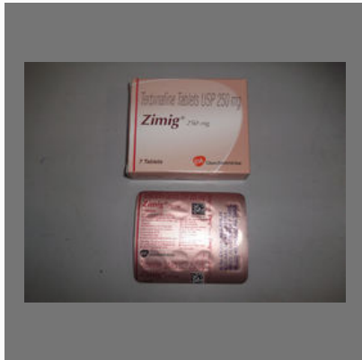
Terbinafine 250mg Tablets