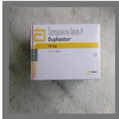
Dydrogesterone 10 Mg Tablet