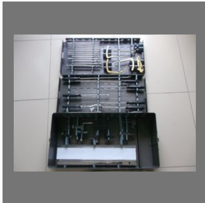
Arthroscopy Instrument Complete Set for ACL / PCL knee Surgery