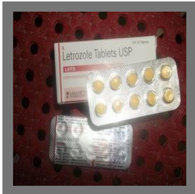
Letrozole 2.5 Mg Tablet