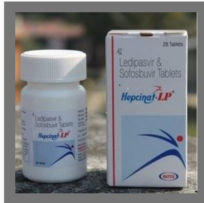
Ledipasvir 90mg And Sofosbuvir 400mg Tablets