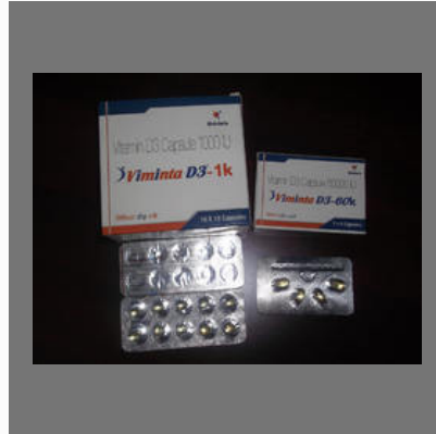
Vitamin D3 Softgel Capsules