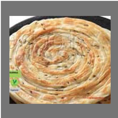
Frozen Jeera Paratha