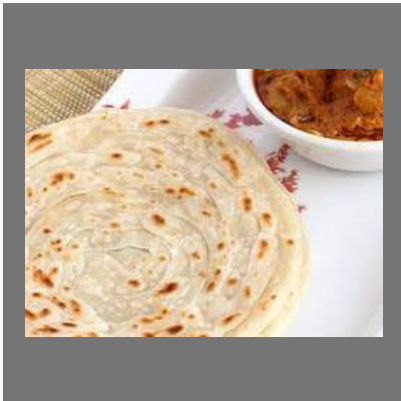
Frozen Lacha Paratha