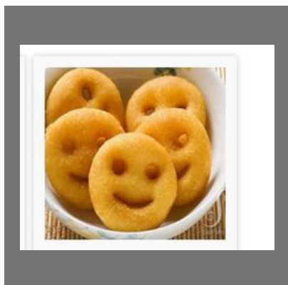
Frozen Veg Snacks