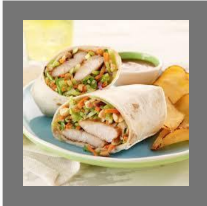
Frozen Paneer Wrap