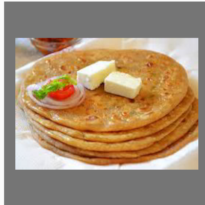
Frozen Paneer Paratha