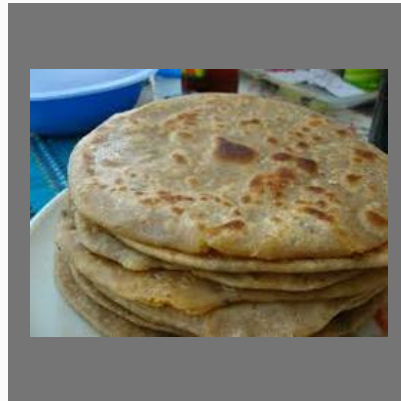
Frozen Aloo Paratha