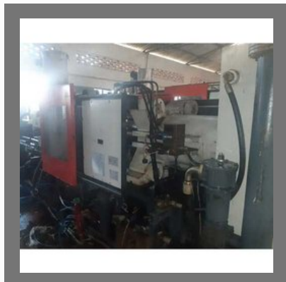
350 Ton Injection Moulding Machine