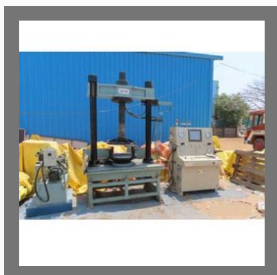
Valve Test Rig, Single Station Test Bench