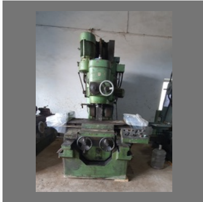
Used Vertical Milling And Boring Machine