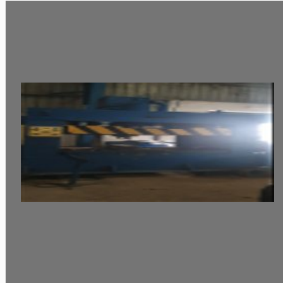
Used 160 Ton Hydraulic Press Machine