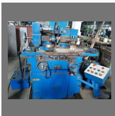
Hydraulic Cylindrical Grinding Machine