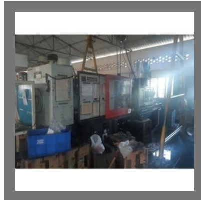
200 Ton Injection Moulding Machine