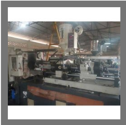
150 Ton Injection Moulding Machine