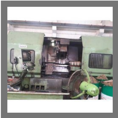
CNC Lathe Machine