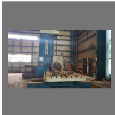
Used Horizontal Boring Machine