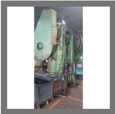
Used 250 Ton Mechanical Press Machine