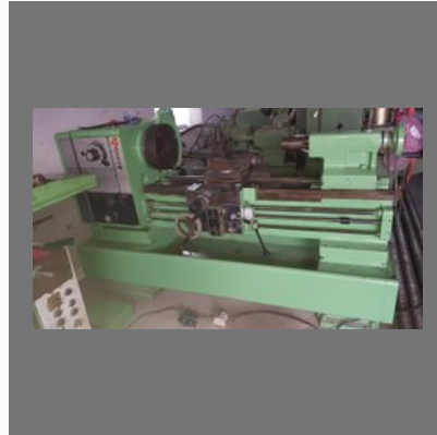
Used All Geared Lathe Machine