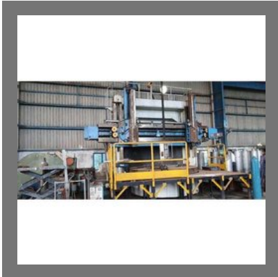
Used Vertical Turning Lathe Machine