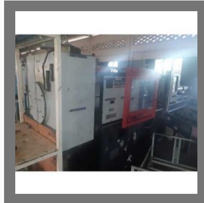
100 Ton Injection Moulding Machine