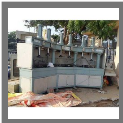
Valve Test Rig 6 Station Hydro Test Bench