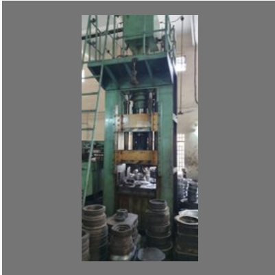
160 Ton Deep Draw Hydraulic Press