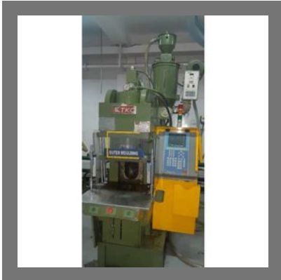
45 Ton Vertical Injection Moulding Machine