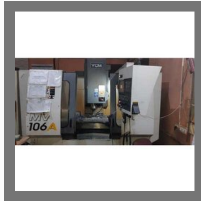
CNC Vertical Milling Machine