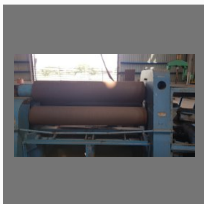
Used Plate Rolling Machine