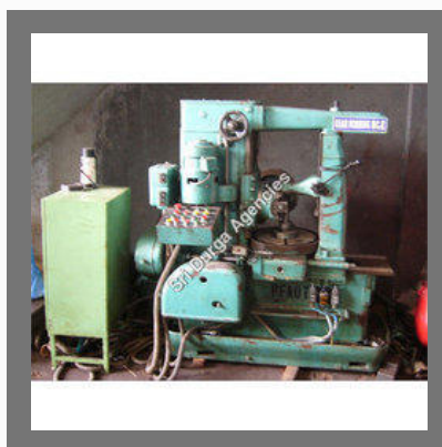
Cold Forging Machine