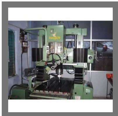
Roll Grinding Machine