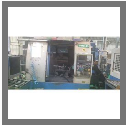
Used Vertical Milling Machine