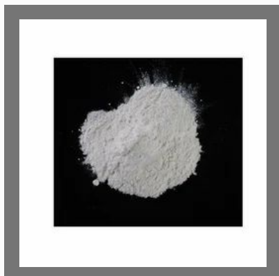
Magnesium Oxide Powder