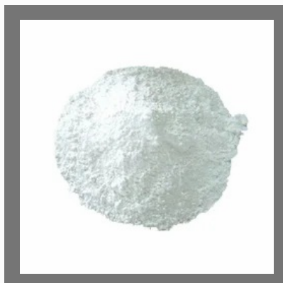
Magnesium Carbonate Powder