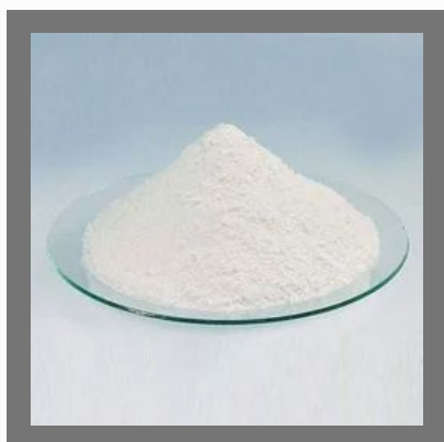
Raw Magnesite Powder