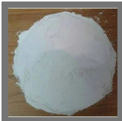
Light Calcined Magnesite Powder